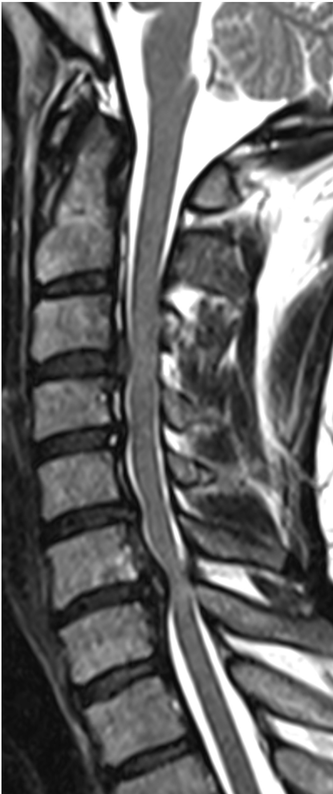
Fig. 1. Preoperative MRI of the cervical spine, T2 sagittal sequence demonstrating intervertebral disc herniation and spinal gliosis at the C6–C7 junction.

syndrome, but experienced partial resolution of her pain and numbness in the right upper extremity. Five months postoperatively, the patient reported resolution of her right arm pain and right arm/leg hypoesthesias, as well as improved visual acuity and resolution of her right eye miosis and ptosis.