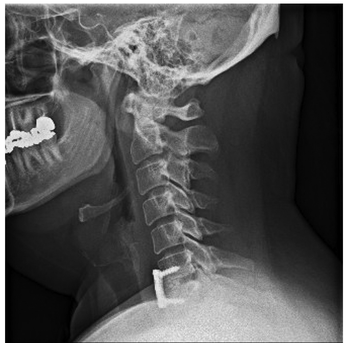
Fig. 3. Five-month Post-operative lateral cervical spine X-ray demonstrating anterior fusion of C6–C7 in standard alignment with no evidence of hardware complication, as well as partial bone graft incorporation at the C6–C7 disc space.