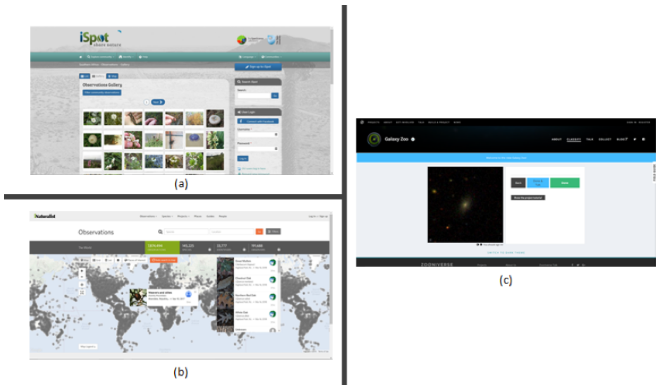
Figure 1. Interfaces of applications included in the CE experiments; a. iSpot; b. iNaturalist.org; c. Zooniverse.

this study. Nonetheless, the majority of our participants (9/15) were between 18–25 years old (with a further two between 25–34; three between 45–54 and one 55+). Only six of the participants had prior knowledge or experience with CS projects, all had experience interacting with online/mobile mapping interfaces and, in terms of their technological skills, five rated themselves as ‘intermediate’, six as ‘advanced’ and four as ‘experts’.