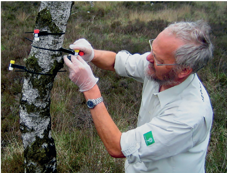
Fig. 23.1 A ranger exchanging a passive ammonia sampler.

Since 2005 the Measuring Ammonia in Nature (MAN) network has monitored atmospheric ammonia concentrations in nature reserves in the Netherlands. The monitoring network is an example of citizen science even if it never was explicitly identified as such. Measurements are performed with commercial passive samplers, which are calibrated monthly against ammonia measurements of active sampling devices. The sampling is performed by an extensive group of local volunteers, mostly rangers, which minimises the cost and enables the use of local knowledge (Lolkema et al. 2015).