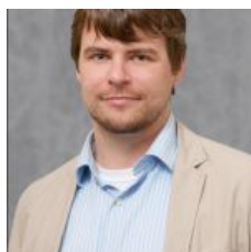
University of Adelaide Australia