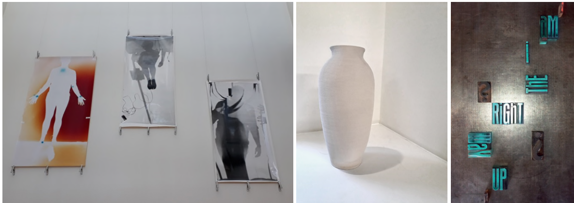
Figure 3. Left panel: Charlie Murphy's 'balance' photograms investigating participants' experiences of self-doubt, disorientation and suspension during balance tests, in the Trajectories exhibition at LifeSpace Science Art Research Gallery, Dundee (2 February – 2 June 2018; http://lifespace.dundee.ac.uk/exhibition/trajectories ). Middle panel: Illusion Vase by Rachel Wilcock (from Central St Martins' BA Ceramic Design collective Studio Senses) using 3d modelling software to visualise changes in perception of shape and orientation from different angles. Right panel: Murphy's typographic experiments with Gaynor's statement provided the stimulus for participatory letter press workshops with people with dementia and care partners during 2017 Dementia Awareness Week.