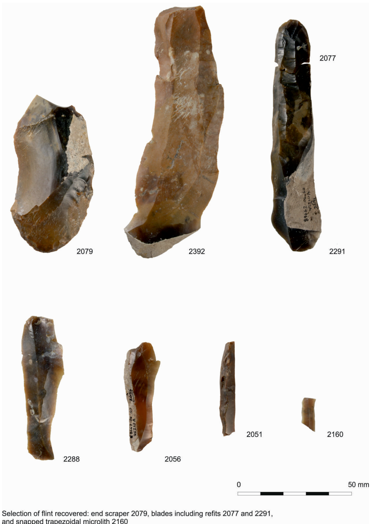
Selection of flint recovered: end scraper 2079, blades including refits 2077 and 2291, and snapped trapezoidal microlith 2160