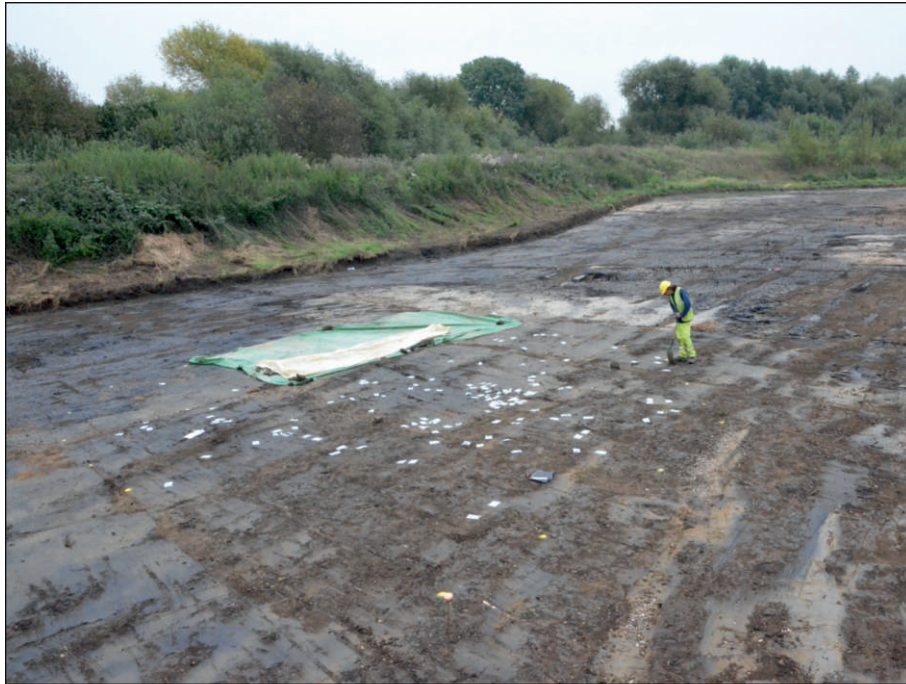
Pre-excavation view of LUP occupation site. The bags mark the position of surface material