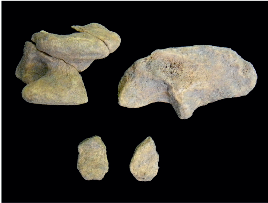
Articulated horse bone (ON 1814, 1815 and 1817)