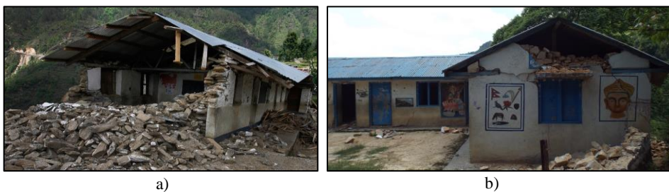
Figure 1. a) Heavily damaged dry rubble stone masonry school building and b) non-structural (gable) damage to a stone in mud mortar masonry school building in 2015 Nepal earthquake

Studies of seismic damages in past events show that some types of construction tend to be more vulnerable than others. In general, old school buildings constructed using masonry materials, e.g. stone, brick, mud etc., are inherently more vulnerable than modern engineered constructions. Figure 1 shows damages to stone masonry school building during the 2015 Nepal earthquake. These represent a large proportion of school buildings in Nepal and many other South-Asian countries and their response varies, depending on a number of construction solutions. Thus, the preparation of a catalogue of school building types, valid across many nations and using such catalogue to conduct seismic vulnerability assessment and define strengthening strategies is a fundamental step towards disaster risk reduction (D'Ayala et al., 1997, Coburn and Spence, 2002).