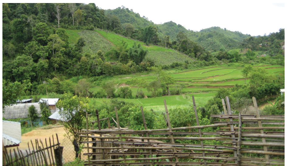
Figure 1: Land-use systems are often mosaics, incorporating multiple forms of land use simultaneously. In this village in the Philippines, irrigated rice fields are grown near the settlement, while the hillsides are used for swidden farming. This land-use regime would be classified as agriculture in level 1 of the LandCover6k land-use classification (Fig. 2), flooded-field farming and swidden in level 2, and rice paddy/taro pondfield in level 3. Domesticated animals and crops would be coded separately.

Agriculture is the most internally diverse land-use class, reflecting both its history and significance to landscape transformation. The level 2 classification of agricultural forms (Fig. 2) is therefore the most finely subdivided. Not all croplands are