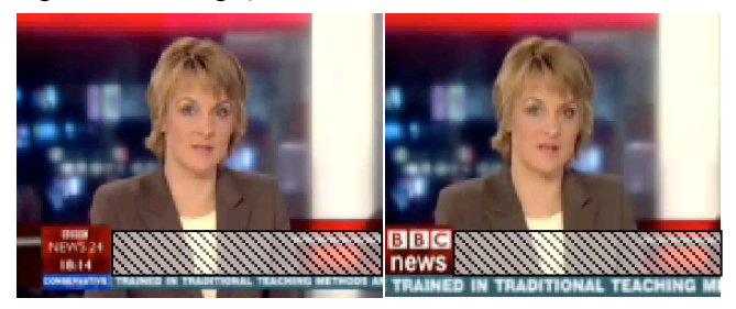
Figure 1: Content before (l.) and after (r.) editing steps. Text inserts appeared in the hatched area.

whole horizontal length of the picture. The height of the ticker line ranged from 9 to 12 pixels for the four resolution sizes with the respective text height of the capitalized text ranging from approximately six to eight pixels. At a viewing distance of 40cm this resulted in a viewing angle of the ticker text of 11 arc minutes for the smallest image size. The rest of the picture was slightly condensed in the vertical dimension to accommodate the ticker. This allowed for comparisons of results with [6] since the amount of presented information was approximately equivalent (compare Figure 1 left and right).