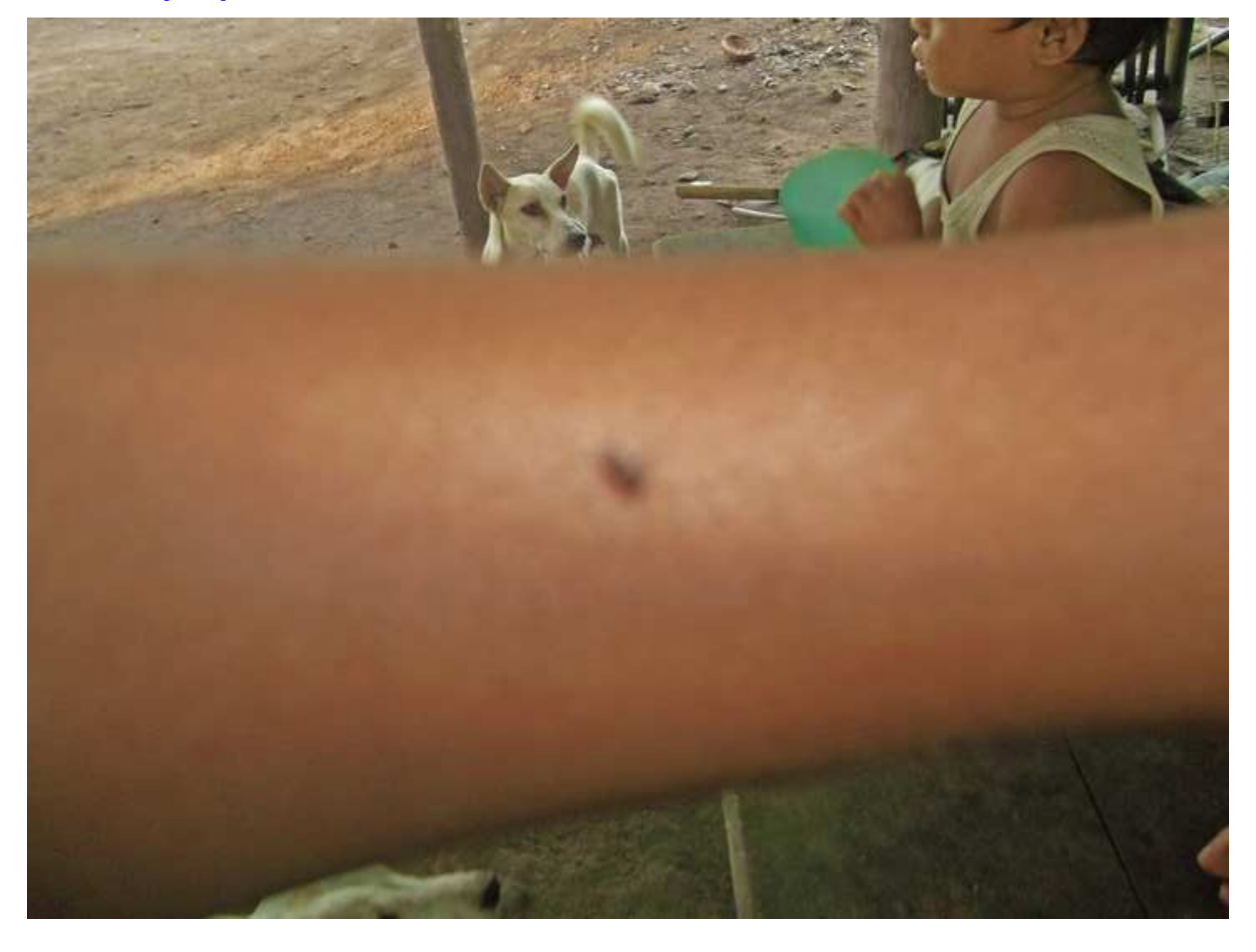
Figure 1 Click here to download Figure: Figure 1.JPG