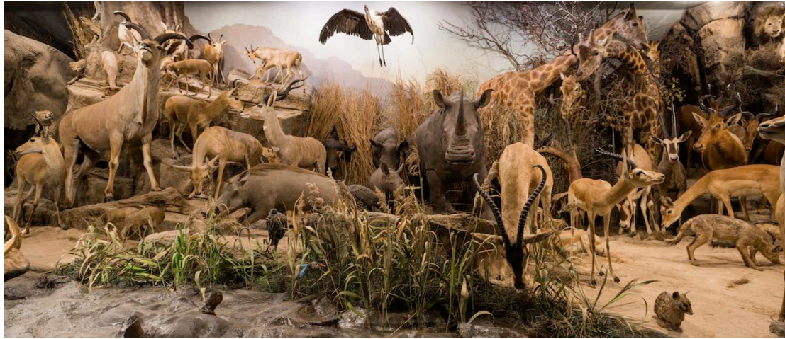
Fig. 11.3 Diorama in Gallery 3.

Gallery 2, called ‘The Pavilion’, was the first gallery designed and built by Percy Powell-Cotton and the starting point for his relationship with the taxidermist Rowland Ward, who helped build and design the museum’s famous natural history dioramas (Powell-Cotton Museum 2015b; Fig. 11.2).