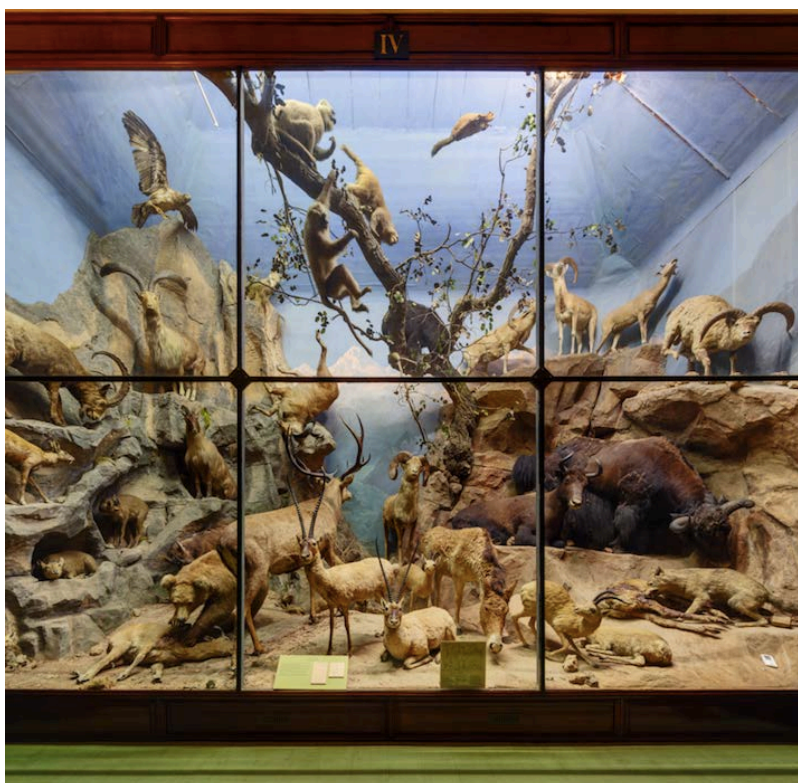
Fig. 11. 2 Kashmir Diorama in Gallery 2.

At the Kashmir diorama in Gallery 2 (Fig. 11.2) of the Powell-Cotton Museum a boy exclaimed, “ Look, See! At that animal, he’s fallen off. The wolf’s made him fall off ”. A goat is depicted falling from the top of a cliff where there is a wolf as well. An observation such as this would provide an opportunity to discuss further gravity and forces.