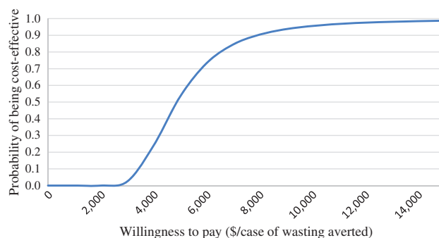
Figure 1. Cost-effectiveness acceptability curve for averting cases of wasting in DC arm compared with the CG.

Results of univariate sensitivity analyses are summarized in Table 9 as changes in ICER for each model when cost and outcome variables were varied between their maximum and minimum