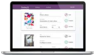
Figure 6: Moderator reviews pending requests