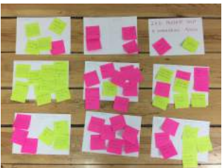
Figure 2: Affinity diagram