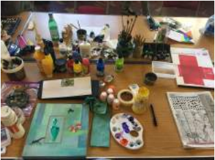
Figure 1: Art table at 240 Project.

"They got works sold in our annual exhibition or published in the Big Issue magazine, which was a big thing for us" - Social worker II