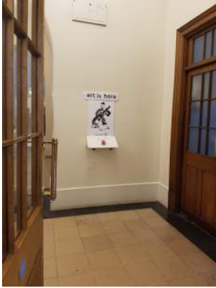
Figure 8: Low fi prototype