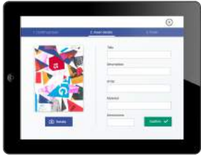
Figure 5: Members use a tablet to document their art