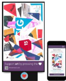
Figure 7: Public interacts with digital screen and online store