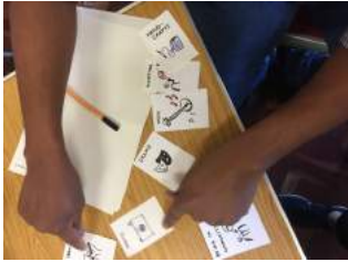
Figure 3: Card sorting method