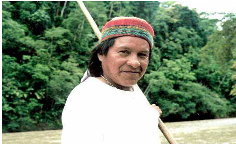
Figure 6.6 Embera Katio leader, Kimy Pernía Domicó.

territory's strategic location. 57 And third, the social and socioeconomic process associated with internal armed conflict that affects indigenous peoples' traditional territories and cultures, integrating factors that are aggravated by the conflict , 'that increase vulnerability, such as poverty'. 58