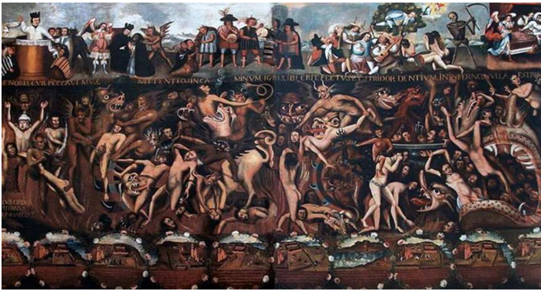
Figure 4.5 The Hell of the Series 'The Aftermath' , José López de los Ríos (1684). Carabuco Church, La Paz.

that they represent the beings of the Andean underworld in proper indigenous manner. In this way, Andean indigenous peoples did not see and did not represent those demons as evil forces but as key allied deities, who resonate with their own cosmological beings. In such a context, the indigenous world not only made the birth of an international legal order based on a global economy driven by the silver obtained from Potosí possible, 27 but also adjusted such an order to its own geographical space, where the Incas had formed a powerful confederation, able to resist colonial impositions openly through indigenous uprisings and covertly through Andean cosmologies.