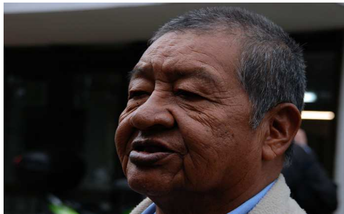
Figure 6.3 First President of the National Indigenous Organization of Colombia, Trino Morales.

Taita Víctor have done—indigenous peoples continue to honour their ancestors’ work by training new generations of leaders. Acknowledging precisely such an endeavour, the Second National Indigenous Congress’ plenary appointed Jacanamijoy as ONIC vice-president for the period 1986–1990. This historical interval characterized by the strengthening of local grassroots would prepare the terrain for the consolidation of a strong social movement at the national level: Indeed, it would be the first Latin-American indigenous movement able to reach a Constituent Assembly and, subsequently, to gain recognition of cultural diversity and of indigenous jurisdictional systems in 1991, in an event that would become a reference point for the international indigenous movement.