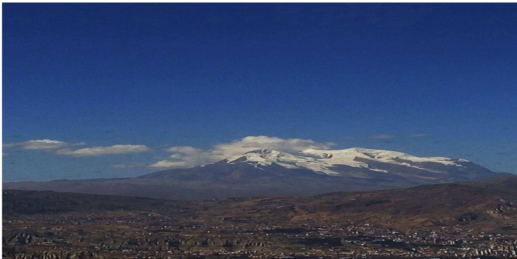
Figure 4.3 Illimani, seen from La Paz, Bolivia.