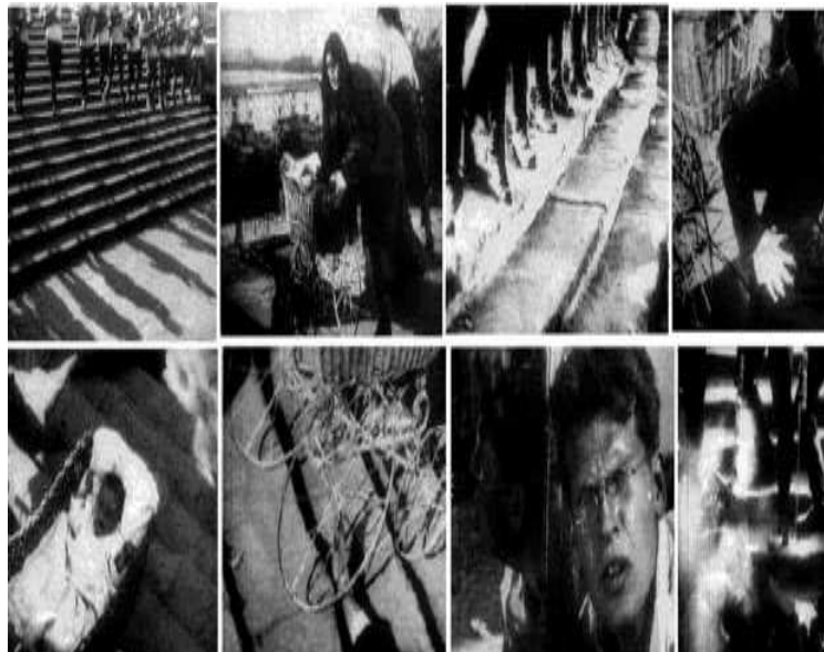
Figure 3.3 Battleship Potemkin, Sergei Ezeinshtein (1925). Act IV: The Odessa Steps.

and covertly in Convention 169. Although the UN Declaration on the Rights of Indigenous Peoples has opened doors to proclaim the right of self-determination condemning the crime of genocide, the willingness of UN member states to take up their associated responsibilities is still weak. I sustain here, that the darker side of the ‘storm’ is the history of the crime of genocide of indigenous peoples in international law and beyond. Likewise, the spectral way in which the persistent denying of indigenous peoples’ political and ontological self-determination is connected with their ongoing genocide, and the silencing of indigenous jurisdictions speech is underpinned under the functionality of a system that is putting indigenous peoples’ survival at risk.