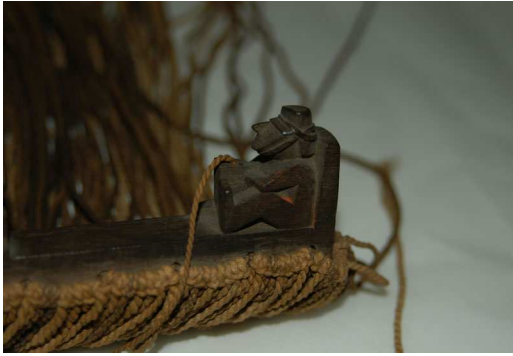
Figure 4.7 Khipu on wooden Bar. Ethnological Museum of Berlin