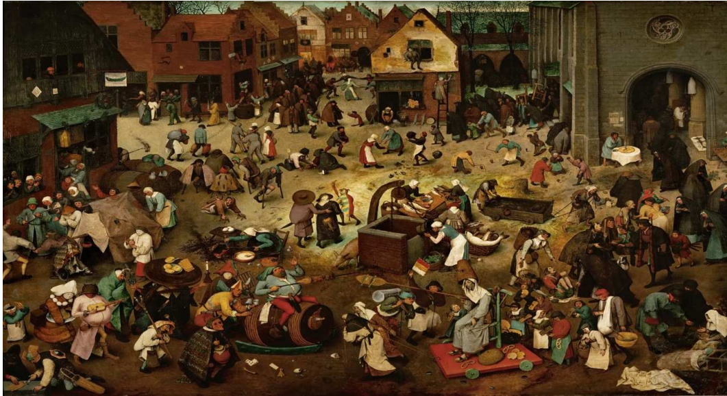
Figure 2.5 The Fight between Carnival and Lent , Peter Bruegel the Elder (1559). Kunsthistorisches Museum, Vienna.

This methodological standpoint, following an inverse legal anthropological logic, prompts the following questions. 89 What would happen if the legal ethnographer ‘loses the strategic advantage of explaining and interpreting, translating and introducing, textualizing and contextualizing, justifying and signifying’ the meaning of indigenous jurisprudence? What if indigenous jurisprudences were to function within the framework of indigenous peoples in international law in a way that produced an interaction of knowledge between them? And most importantly, what might occur if the indigenous legal systems were to be allowed to modify the legal systems of nation states and those that configured the international legal order by indigenizing international law from an inverse legal anthropology ?