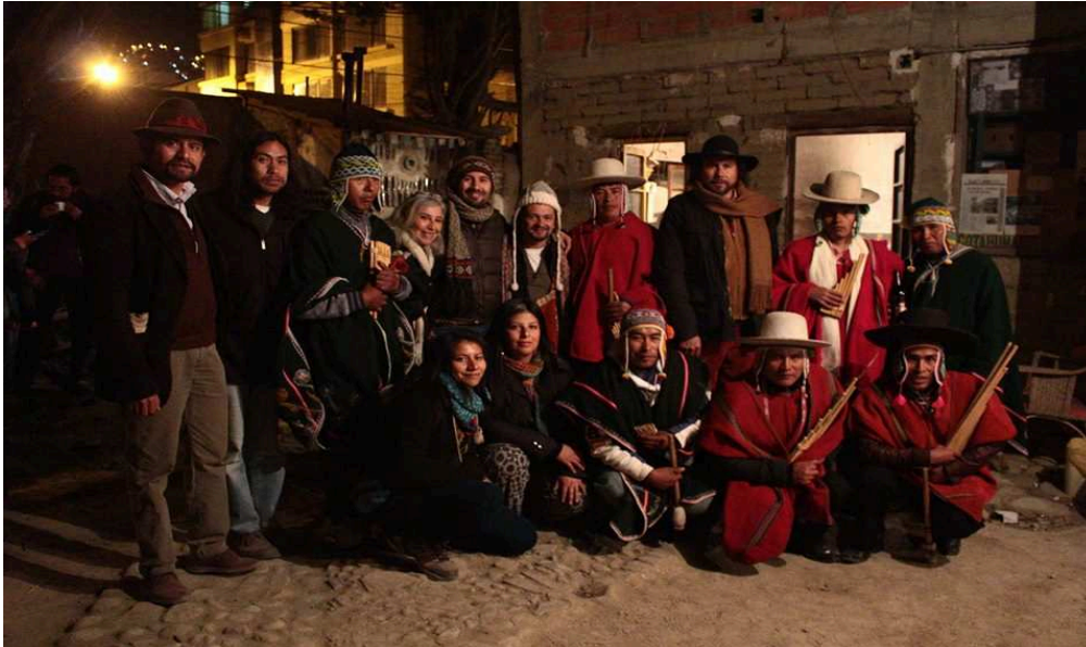
Figure 1.2 Community Meeting at El Colectivo Tambo.