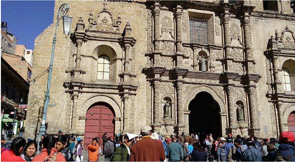
Figure 4.2 Basilica of San Francisco, La Paz, Bolivia.

that leads to a corner from which it is possible to see the Illimani, the highest mountain in the Cordillera Real and one of the main geographical and cosmological referents of the Aymaras—the people to which Rivera belongs (see Figure 4.3). Thus, I feel that I can be closer to Rivera’s work, always enriched by the double bind between her own indigenous sources and Western epistemological frameworks.