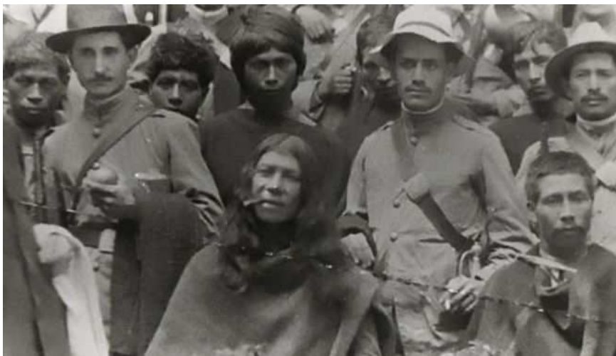
Figure 5.3 Manuel Quintín Lame at his 1916 arrest at San Isidro

indigenous people were killed and injured, and many villagers of Inzá were also hurt. The versions, however, do not agree on who and how the violence started. A new confrontation was presaged and, in effect, the news of the first clash arrived to the central government on 12 November when the governor of Cauca, Antonio Paredes (1916-1917), reported to the Minister of Government that an estimated five were dead and fifteen injured, apparently, all indigenous people. The Inzá major confirmed to the prefect of La Plata that one of the injured was Lame himself. 80