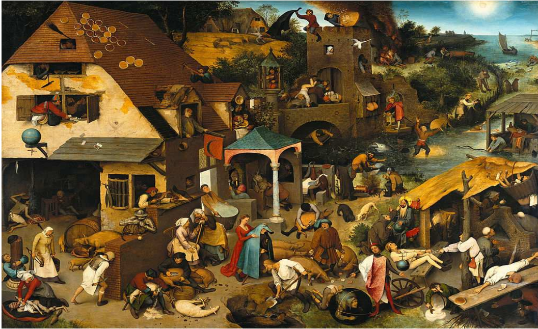
Figure 2.4 The Netherlandish Proverbs , Peter Bruegel the Elder (1559). Gemäldegalerie, Berlin. Courtesy of Wikimedia Commons

In these types of works, Bruegel a true ‘anthropologist’, is not only performing the practice of long observation but also orienting the creation of culture in terms of the manufacture of concepts through practices of learning. Bruegel was captivated by the peasants’ daily life and was thus able to narrate a sophisticated history of sixteenth century life. Moreover, Bruegel was obsessed with proverb and allegory—a symptom of his artistic penetration of the folkways. Indeed, his ‘ethnographic work’ circulates between the powerful metaphors of proverbs (certainly a core part of the folk wisdom of the peasantry) and the creation of an everyday culture portrayed throughout the humanization of customs and traditions of simple people. ‘Allegory came to be the form in which the meaning of Bruegel’s pictures was imparted, and intended. Like the anthropologist, his invention of familiar ideas and themes in an exotic medium produced an automatic analogic extension of his world’. 84