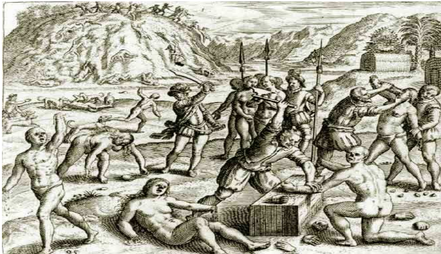
Figure 3.4 Christopher Columbus' Soldiers Chops the Hands Off of Arawak Indians who Failed to Meet the Mining Quota , Theodor De Bry. Included in later editions of Brevísima Relación de la Destrucción de las Indias , 1552 by Bartolomé de las Casas

In 1947, the Secretary General of the United Nations submitted a draft of the CPPCG that expressly included that the intention and action of bringing about the disappearance of human groups 'can be undertaken and committed, separately or concurrently, in many different ways'. 68 Indeed, the draft instrument was more careful when defining the scope of the crime. On the one hand, the level of detail with which the draft tackles the meaning of destruction and physical harm is accurate. On the other, it repeats the