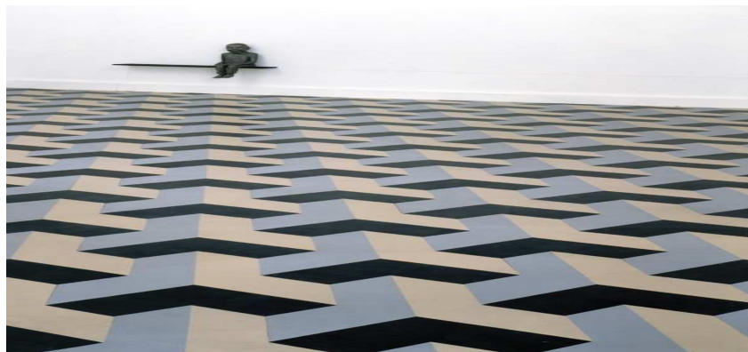
Figure 2.1 The Wasteland , Juan Muñoz (1986). Bronze, linoleum and steel; variable dimensions. Juan Muñoz, Double Bind & Around (Hangar Bicocca, 2015).

Muñoz plays with spatial coordinates and illusory expedients to induce consideration of the exhibition space, the presence of the viewer and the distance between the viewer and the dummy, thereby creating a psychological tension between the two. Whereas on the one hand the viewer is attracted by the optical design of the floor, on the other the presence of the figure creates an alienating condition that emphasizes the distance between the viewer and the object. 30