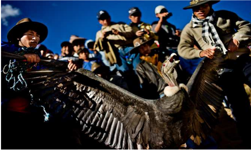
Figure 2.3 ‘A condor was paraded through Coyllurqui, Perú, during the Yawar Fiesta.’ (10 August 2013).