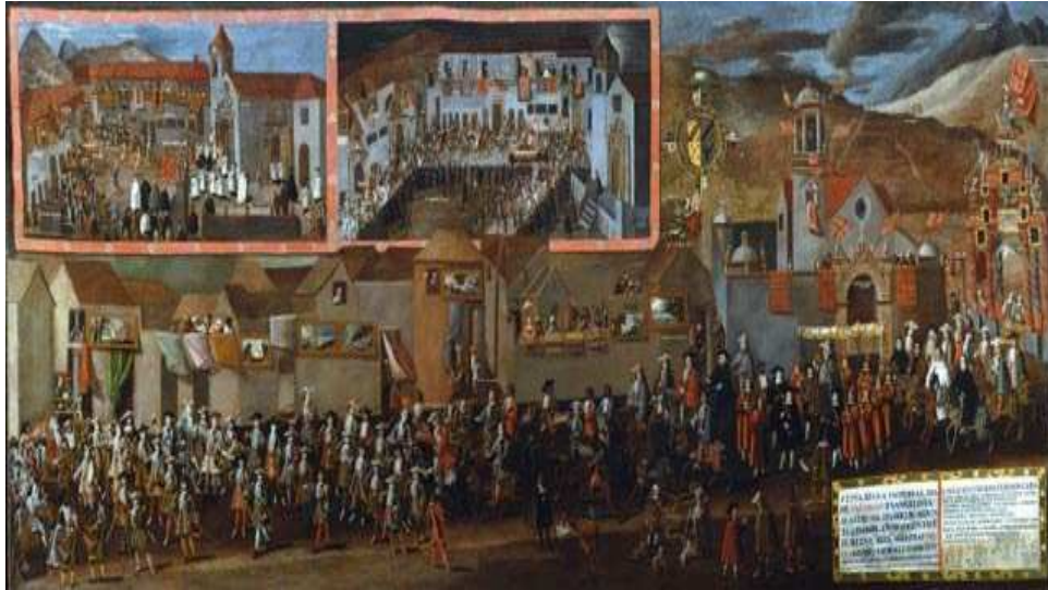
Figure 4.6 Entry of Viceroy Morcillo into Potosí , Melchor Pérez de Holguín (1716). Museum of the Americas, Madrid.

Potosí from Madrid to La Paz (see Figure 4.6). This painting is crucial to understand the eighteenth century colonial microcosms, which surrounded the Potosí imperial village.