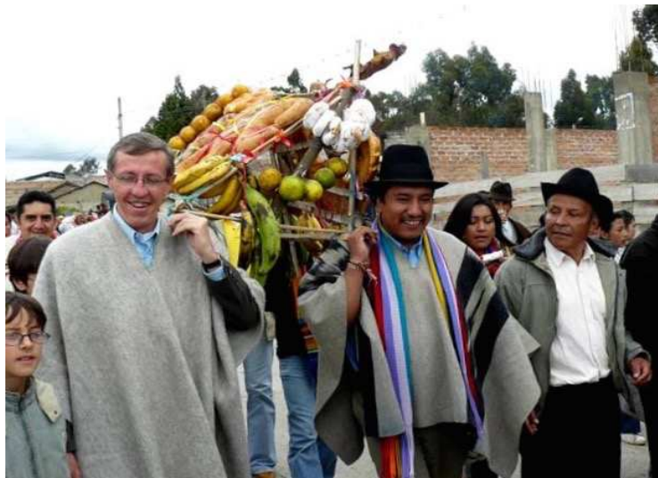
Figure 6.4 In a distinctive indigenous reappropriation, a few decades after the Constituent Assembly of 1991, Antonio Navarro Wolff, acting as governor of the southwest Nariño Province, celebrates the Andean New Year (Inty Raimy) together with the Pasto nation; to his left, Taita Ramiro Estacio, ex-Senator of the Movement of the Colombian Indigenous Authorities.

the first meetings between Colombian leftist parties and social movements that took place at the Centro de Investigación y Educación Popular-CINEP (Centre for Research and Popular Education, located in Bogotá), the former leader of the 19 th of April Movement (M-19), Antonio Navarro Wolff, who at that moment represented the political party that entered mainstream Colombian politics, the M-19 Democratic Alliance—after demobilization through a peace agreement—proposed the integration of indigenous leaders within the M-19 platform (see Figure 6.4).