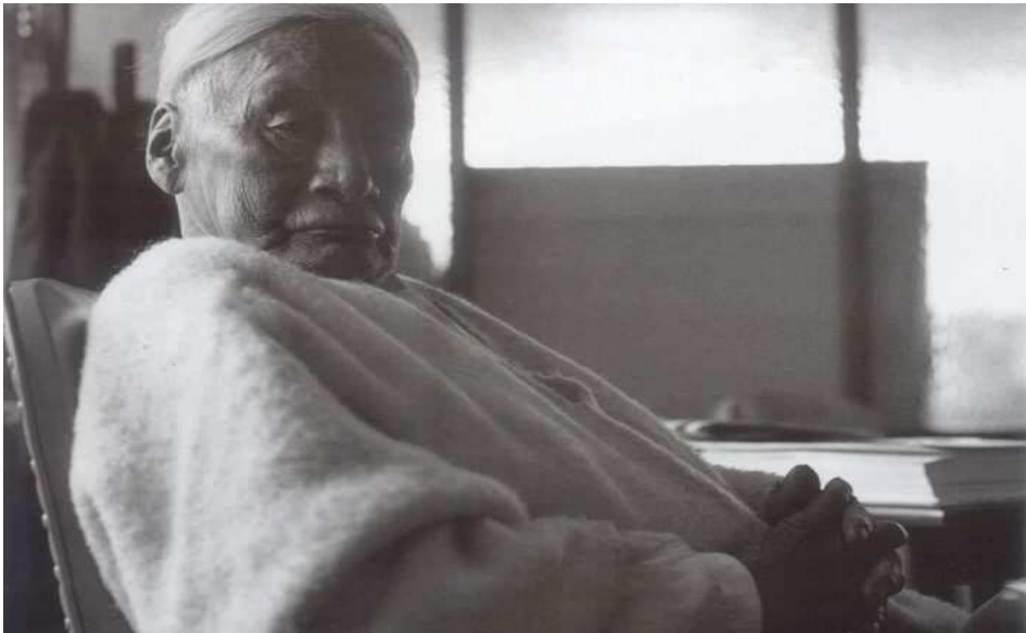
Figure 5.1 Manuel Quintín Lame in his later years

accusations that confined him to prisons during extended periods during his life.