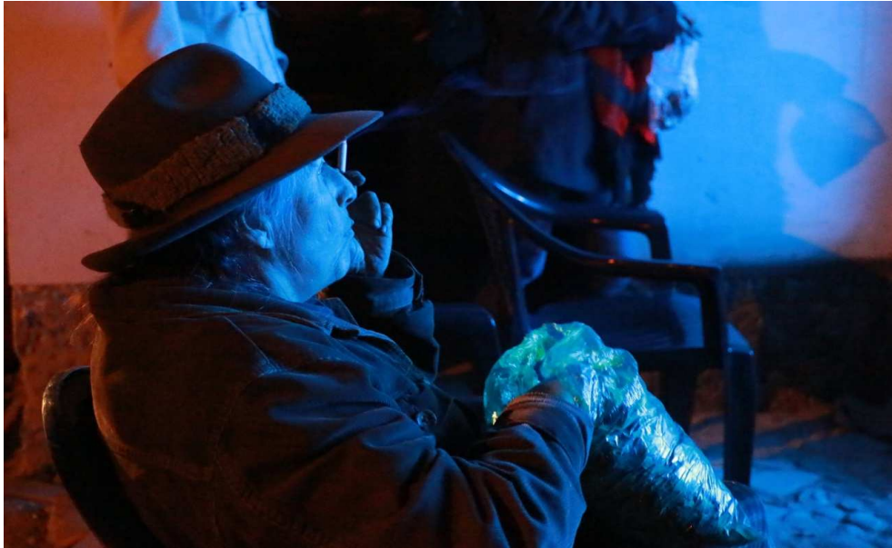
Figure 4.1 Tambo El Colectivo with Silvia Rivera Cusicanqui commenting on her course on the sociology of the image.

the popular movements in the following years, especially in the organization of the ayllus of western Bolivia, the CONAMAQ'. 3