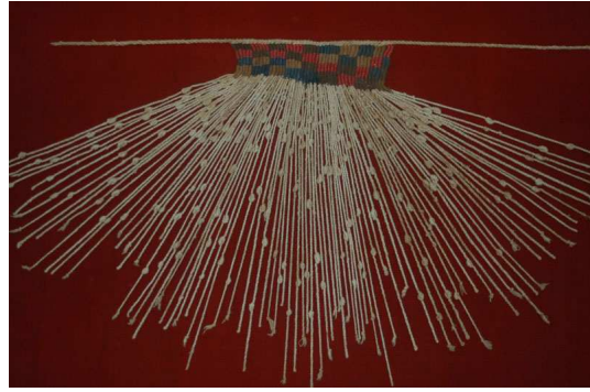
Figure 4.8 Canuto Khipu. University of San Martín de Porres, Lima, Perú