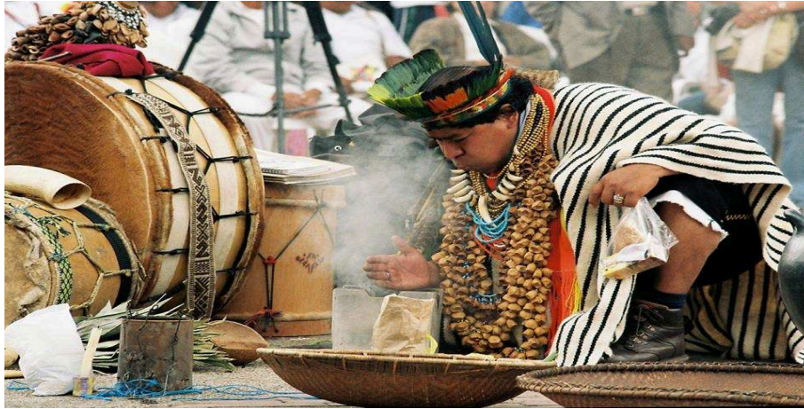
Figure 1.3 Ex-Vicepresident of the National Indigenous Organization of Colombia, Taita Víctor Jacanamijoy Jajoy, serving as Inga healer in a ceremony of indigenous harmonization.