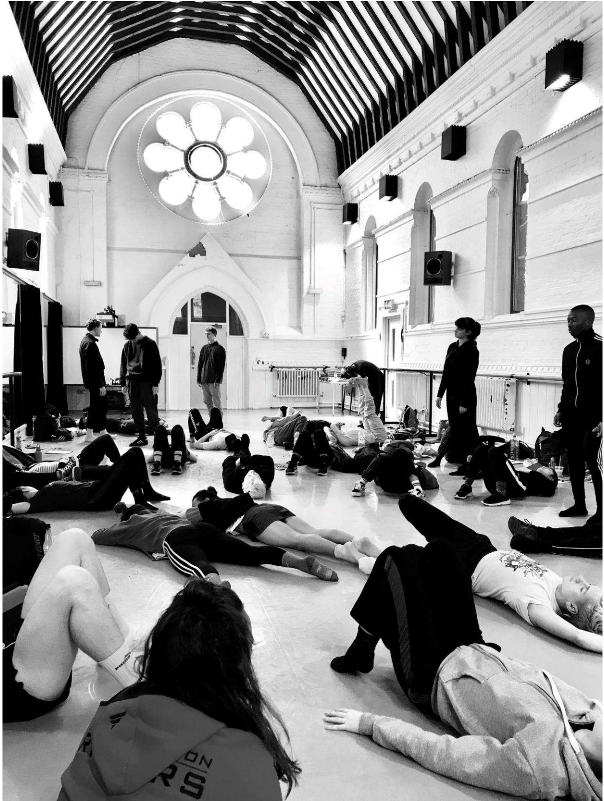
Figure 3 Movers in the chapel studio

The dancers in this experimental project were in their second year of undergraduate study, and though they had had a large reflective component throughout their first year and had a