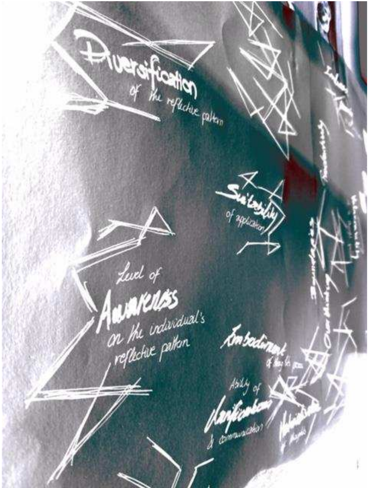
Figure 4 diversification of reflective practice.