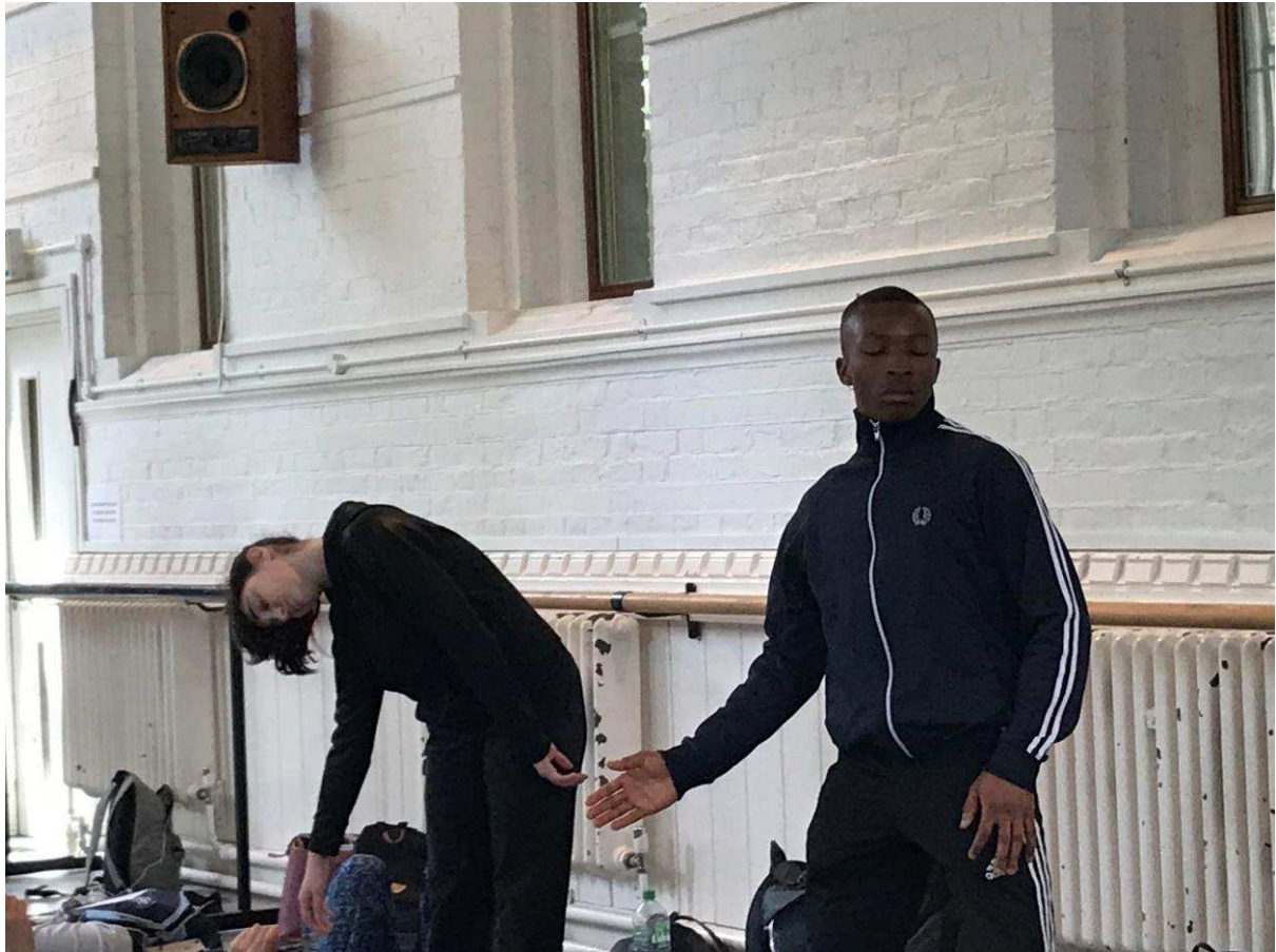
Figure 2 Eyes closed