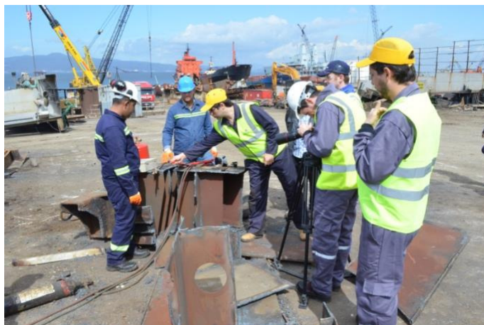
Fig. 3: Ship DIGEST Vocational Education Filming Activities