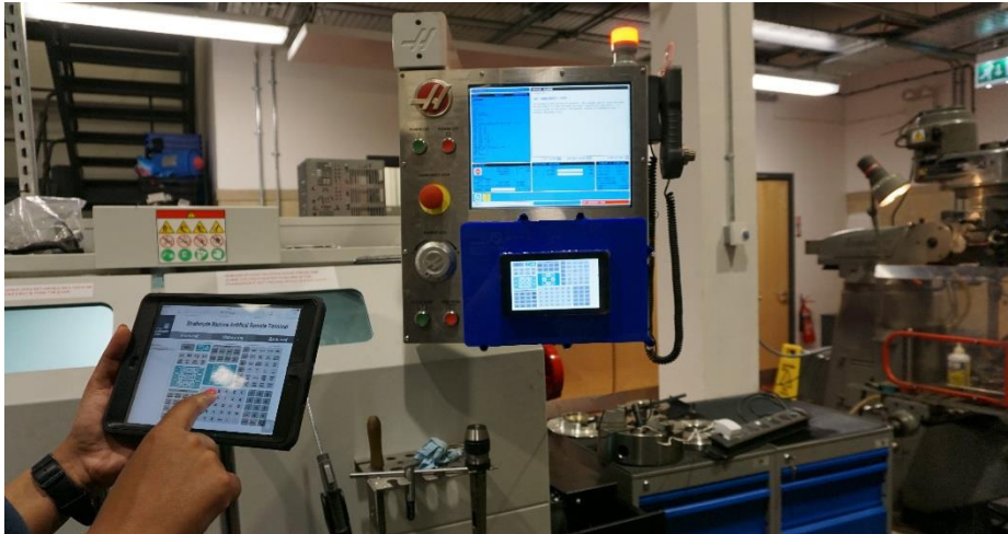
Fig. 3. Remote maintenance interface mounted on a HAAS control panel.

Android® tablet was used to control the CNC machine over the Internet using the Web Interface shown in Fig. 2. Proximity to the machine is not required and that the machine could, in principle, be operated from anywhere in the world. To test the physical device, inputs were actuated from the front panel as shown in Fig. 3. All the trial commands were recorded on the log page along with user comments.