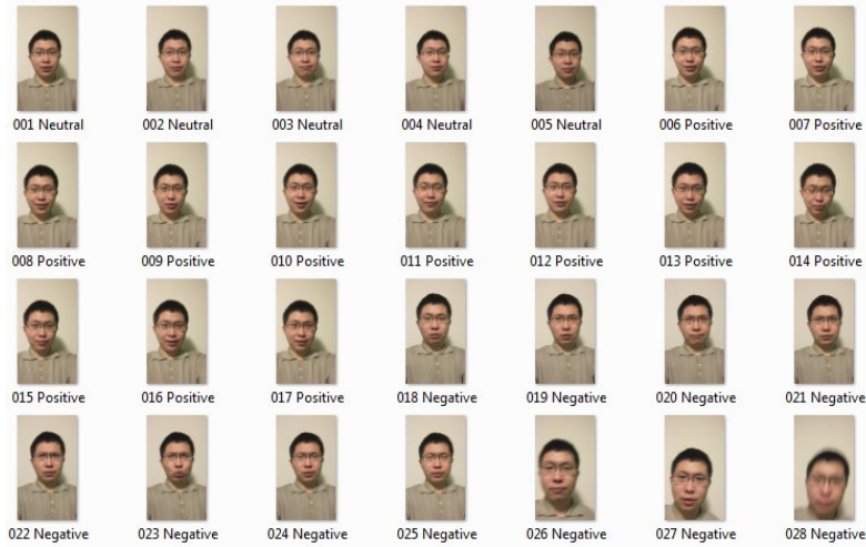
Fig. 2. 2nd testing dataset

In the second experiment the facial expressions employed are either positive emotions (happy, enjoyment, relaxed), negative emotions (unhappy, sad, angry) or emotionally neutral. This experiment investigated how to recognize the author's facial expressions when talking. There are 28 images in the testing dataset and 17 images in the training dataset. The images in the testing dataset are shown in the Fig. 3. The recognition accuracy of facial expression is 85.7%. In particular, images 5, 25, 26, & 28 are inaccurately classified. Naturally occurring emotional life facial expressions show more changes and variation. Moreover, there are changes in the head pose and mouths. Thus, the complexity of the task of recognition complexity is increased.