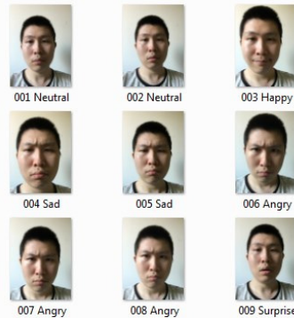
Fig. 2. Testing dataset

For the first experiment, the training and testing dataset used the author's facial expressions. Five facial expressions are selected for the experiment: neutral, happy, sad, angry and surprise. For the training set we have obtained a range of images acquired in different contexts, i.e., in home and in work, with glasses and without glasses, under different background and different lighting conditions. Currently, only some images are used. In the first experiment, 23 images are in the training dataset and 9 images are in the testing dataset. The images used in the testing dataset are shown below in Fig. 2: