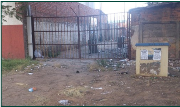
Alleyways in Harare are often places of temporary shelter to street children and youth.

Without shelter, maintaining cleanliness (and the right to privacy) is challenging; “after bathing we dress up in the open, we bathe in the open” (Accra group 5), and “you may spend three months without brushing your teeth” (Harare group 3). Lack of shelter can force girls into sexual relationships and exploitation, where boys or men demand sex in return for a sleeping place. A female participant explains: “when you come to the street as a young girl, because you don’t have a sleeping place, you will accept any proposal from a guy who has a kiosk, you will become the girlfriend to that boy and this can lead to early pregnancy” (Accra group 7).