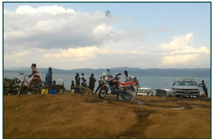
Car and motorbike washing (on the shores of Lake Kivu, Bukavu); informal and unlicensed income disrupted by authorities.

Children and youth may come to the city because they anticipate greater freedom to earn money, for example through selling on the streets, in contrast to rural communities. From their arrival, they must meet their own basic daily needs, including food and shelter. For example, boys in Bukavu seek work throwing waste in exchange for food, disentangle fishing nets, or carry loads; “when I am penniless, I must do it, provided that I