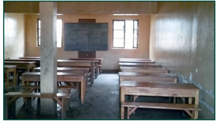
Classroom at a drop-in centre for street children and youth, Bukavu. Participants saw education as key in protecting them against rights violations.

Street children and youth have a clear sense of their human rights and of the effects that their violation and deprivation has upon their lives. Adopting a child rights approach is an important step to street children and youth claiming their rights: "when I am told about my rights I feel free because I am given my rights. It means freedom" (Bukavu group 4). While Article 2 of the UNCRC states that "no child should be treated unfairly on any basis," participants reported experiences of violence, wrongful arrest and detention. Enacting the rights of young people, and those in street situations in particular, requires those who hold power over their lives to change fundamentally their approach at local and national levels.