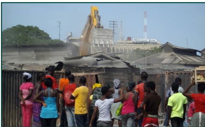
Authorities destroy informal settlements in Accra, Ghana.

In contrast to a welfare approach, which perceives children as victims requiring rescue and restitution to family; or a repressive approach, involving the forcible removal of children from the streets; a child rights based approach requires the recognition of children and youth’s decision, as rights-holders, to live their lives in a street situation (UNGC, p. 9). Participants saw themselves as having the right to live on the street, and described the reasons for their presence there as poverty, mistreatment by family members, lack of job opportunities in rural areas, and lack of food. “Hunger and poverty are the things which push me to live on the street” (Bukavu group 1), but once there they felt, “it is my right to work without disruption” (Accra group 5).