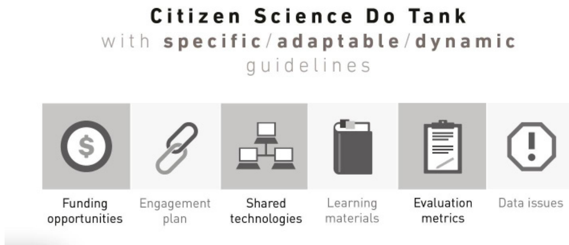
Figure 1: Citizen Science Do Tank Guidelines (2014)

To ensure best practice, the Making Sense framework adhered to guidelines outlined by Citizen Science Do Tank (Sanz et al, 2014).