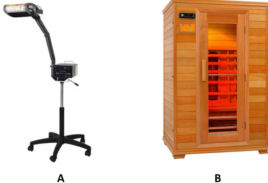
Figure 1 (A) Far Infra-Red (FIR) ray device. (B) FIR suna.