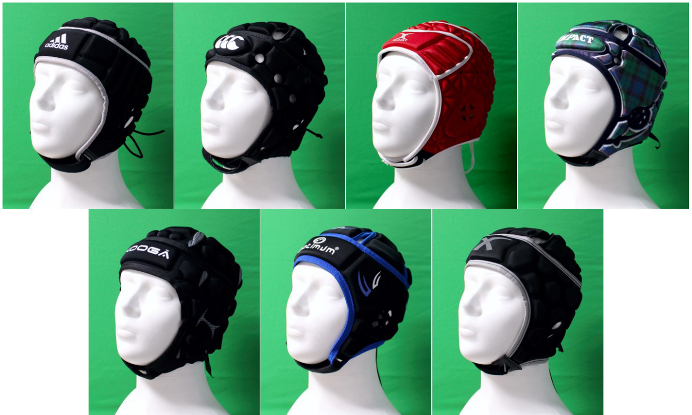
Figure 1 Headguards selected for testing (left to right): Adidas Rugby headguard (£34.95), Canterbury Ventilator headguard (£42.00), Gilbert Evolution headguard (£34.99), Impact RWC Tartan headguard (£39.99), Kooga Combat headguard (£28.99), Optimum Hedweb Classic headguard (£24.99) and XBlades Elite headguard (£34.99).