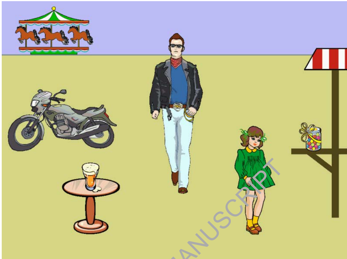
Figure 1. Example visual display from Experiment 1. Participants heard NP modifier sentences like ‘The girl who likes the man from London will ride the carousel’ or VP modifier sentences like ‘The girl who likes the man very much will ride the carousel’. For these example sentences, the carousel was the Global object, the predictable direct object of the main clause subject and verb (e.g. ‘The girl ... will ride...’), and the motorbike was the Local object, the predictable direct object of the locally coherent syntactic combination in NP modifier sentences (e.g., ‘the man... will ride...’).

Sentence (3a) contains a noun phrase (NP) modifier (e.g., ‘from London’), while (3b) contains a verb phrase (VP) modifier (e.g., ‘very much’). In (3a), the underlined string forms a locally coherent active clause, which cannot be grammatically integrated with ‘The girl who likes...’. By contrast, ‘very much’ blocks similar noun-verb attachment in (3b). Similar to Kamide et al. (2003), we tested for anticipatory eye movements to direct objects before the direct object noun (i.e., during the main verb).