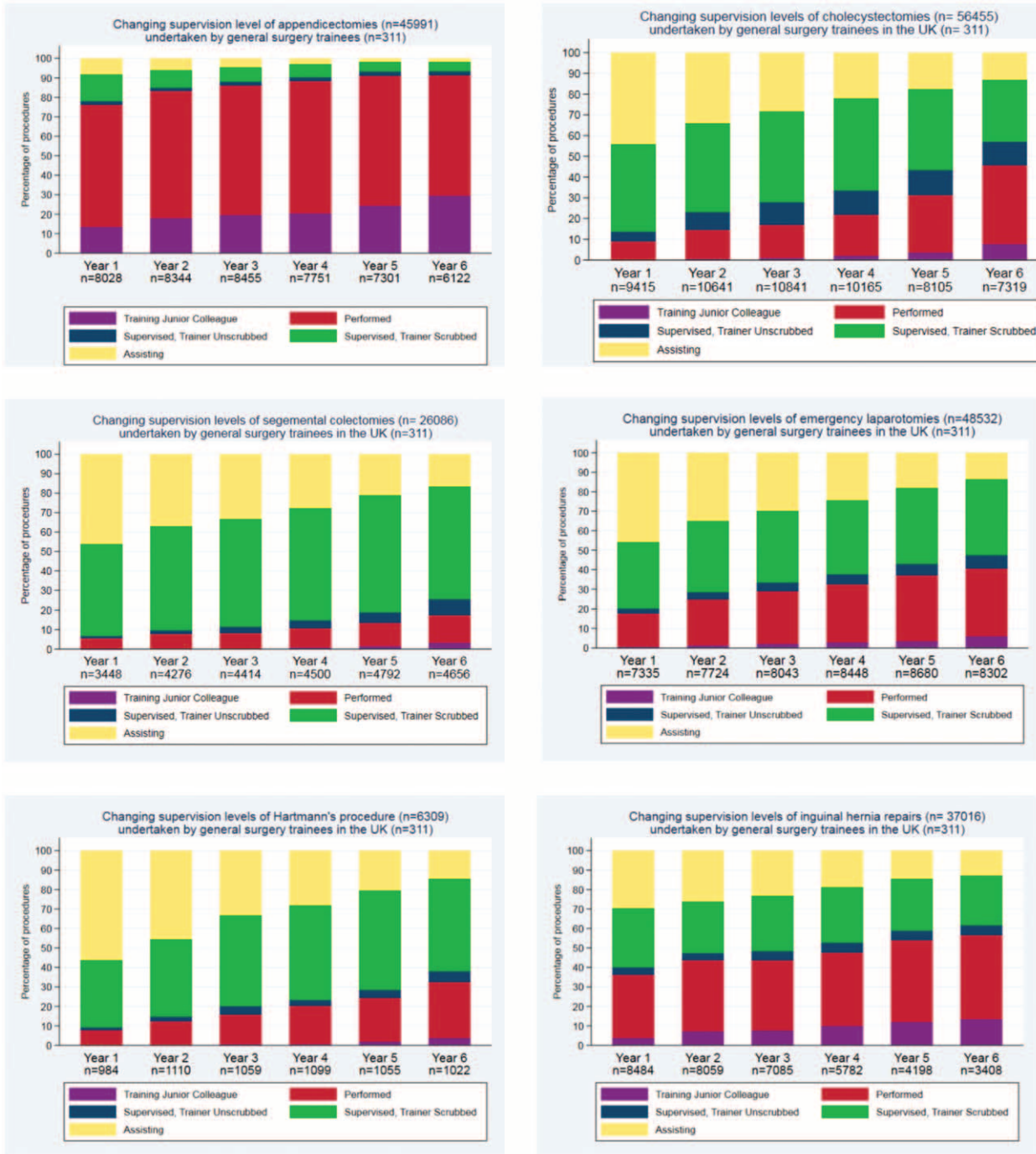
FIGURE 2. Changing supervision levels for index procedures undertaken by UK general surgery trainees.

in the UK. Some trainees, with completion of overseas training before entering UK general surgery specialty training, are already technically proficient in a wide range of procedures. Some UK trainees may have completed additional training or service provision years prior to specialty training and are experienced technically. It is likely that such trainees are allowed to undertake more complex procedures sooner, reflected in the small proportion of year 1 and year 2 trainees undertaking colectomies (5.6% in year 1) or emergency laparotomies