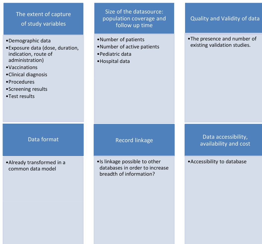
Figure 1 Coding of the characteristics of electronic healthcare databases available in Europe for the benefit–risk evaluation of medicines. The coding system was binary: 0 if information was absent and 1 if it was present. The degree of completion for a specific variable was not recorded. An exception to the binary classification was done for the accessibility variable: 0, no access; 1, indirect access through database owner or third party; 2, direct access to specific data sources; 3, direct access to full data source.

and inconsistently captured in any of the databases while vaccinations were captured in 13 databases (38.0%). Data on hospital inpatient administered drugs were rarely captured (5.8%).