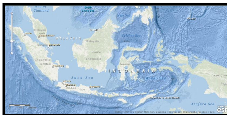
Figure 2. Map of Indonesia [6]

LNG is the superior resource option for Indonesia because of complicated geographical conditions, which consist of several thousand islands, with some separated by a deep sea [5]. As can be seen in Figure 2 below the Indonesian archipelago is located between two oceans, the Pacific and Indian Oceans. The eastern region mainly consists of small islands relatively evenly distributed. [6] with seabed's ranging from 1,000 to 7,000 meters in depth. This configuration of small islands separated by a deep-sea has created a significant challenge to Indonesian government for developing infrastructures in the area. NG pipelines cannot be used in this depth of water for such long distances. It is not technologically appropriate economically efficient to deliver NG to the eastern region of Indonesia. [7] As a result, the Indonesian Government has decided to use a virtual pipeline, which is LNG shipping, to transport NG from areas with excess NG to areas experiencing a shortage of NG.