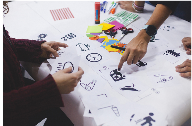
Figure 3. Noise Timeline. Participants complete an activity unpacking the issue of noise using icons on a 24 hour timeline.

[Figure 6] for final version of CLI tool). This tool is composed of a large sheet that has, from left to right, a column for goals, a second column for the types of indicators that could be measured to track progress towards goals and a third column that includes how, who, when and how often these indicators should be collected. There was a vote for most popular indicator to be collected, which was 'measure noise versus stress' with a mobile app, by the participants over a month at daily intervals.