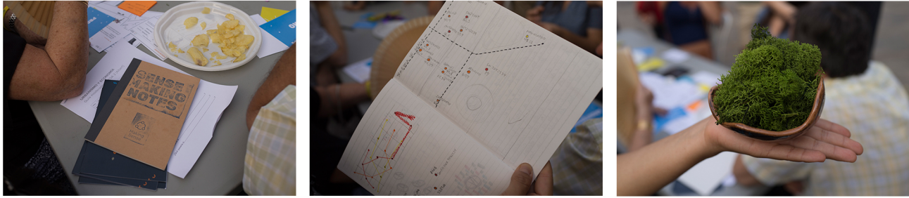
Figure 4. Participant contributions, from left 1) A sensing notes journal for annotating information, 2) Data visualization concepts, 3) prototype for a living wall noise reduction in the Plaça del Sol at the final public event of the Gracia Sounds pilot.

Champions pilot, and the observations from the project team.