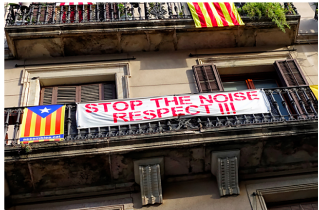
Figure 1. “Stop the noise, respect!!!” Citizens demonstrate their issue of concern using a very public display of warning flags outside a residential apartment in Barcelona.

Developing and monitoring CLIs is a new community centred approach to evaluation methods. The extension of CLIs to participatory sensing responds to a need to document the long-term progress and impact of grassroots data collection [13]. To address current gaps in participatory sensing, CLIs are positioned as complementary information to sensor data and can be used to better understand the sources and causes of environmental issues [38, 14]. Individually they can be inadequate, but in combination with sensor data CLIs can reveal trends to identify areas for action [26]. They differ from sensor data in that the indicators are chosen as important to measure by the community, they are not solely numerical measurements and they are designed to sit