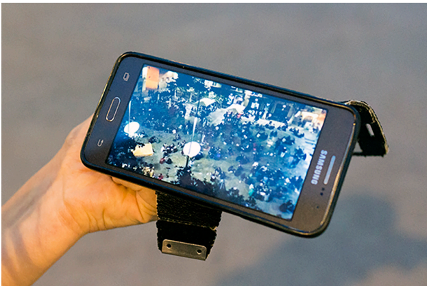
Figure 5. A participant demonstrates how they have captured images evidencing a cause of noise pollution.

Some residents of Plaça del Sol collected information in other ways, for example, one resident took regular photographs of the people in the plaza during peak times using their mobile phone [Figure 5].