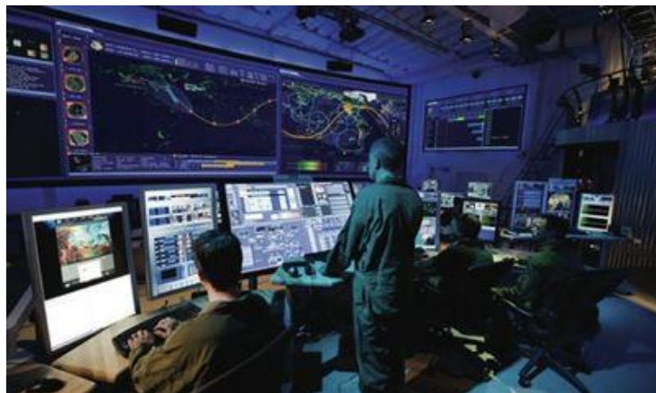
Figure 4: The “JICSpOC” (Pellerin 2015).