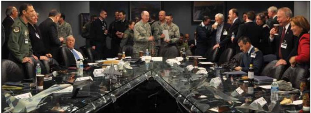
Figure 6: Players at Schriever 2010 (Helms 2010: 13).

Figure 4 shows officials being shown a new 'Joint Interagency Combined Space Operations Center' – the JICSpOC – at Schriever Air Force Base (Swarts 2017b). Figure 5 shows another view of the JICSpOC (a “real-life” command centre), released by the DoD (Pellerin 2015). These representations are then very close to publicly available images representing what a Schriever game looks like in progress. Figures 6, 7, and 8 are publicly released images which represent the internal workings of the games.