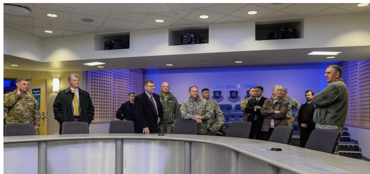
Figure 5: Officials inspect the new “JICSpOC”

Visual representations of actual space command centres have a mix of chairs and tables for discussion, and plenty of technology to presumably implement those decisions. These images also include unit insignia, helping to convey a sense that these places belong to the military, in addition to a slightly science-fiction visual aesthetic with blue lighting, big screens, and brushed steel.