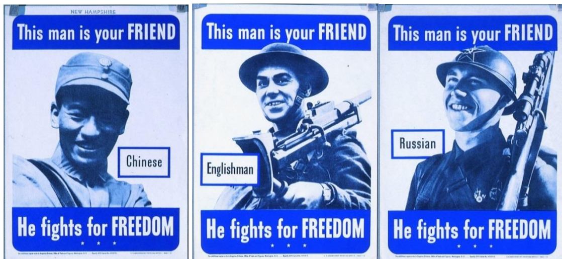
Figure 1: US WW2 propaganda posters (Office of Facts and Figures 1942, New Hampshire State Library N.D.).

The “yellow peril” was countered by official propaganda during the Second World War, as China and the US found themselves fighting on the same side against the Imperial Japanese. Pro-Chinese propaganda included magazine articles (Chiang Kai-Shek was on the cover of Time magazine in 1938 and 1942), film, and posters (Tiezzi 2015). The best example of this is in the striking way in which US propaganda posters represented Chinese in an identical way to English, Australian, Canadian, Dutch, Ethiopian and Russian soldiers (Office of Facts and Figures 1942, New Hampshire State Library N.D.).