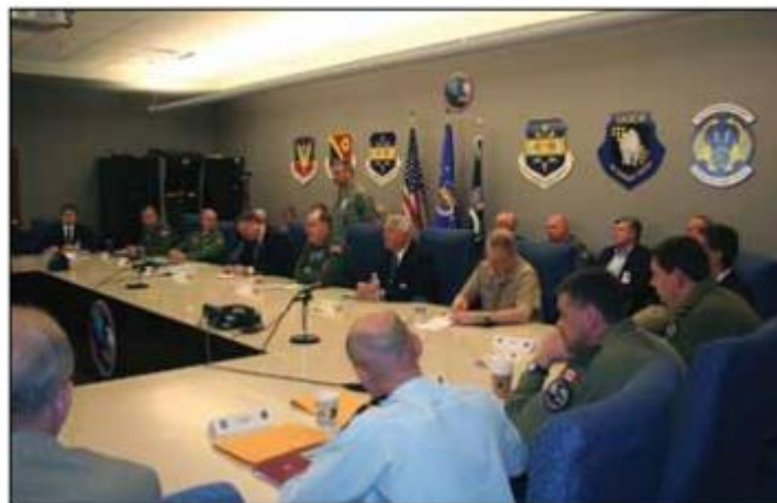
Figure 7: Brigadier Weinstein presents an “outbrief” at Schriever V (Wright 2009: 26).