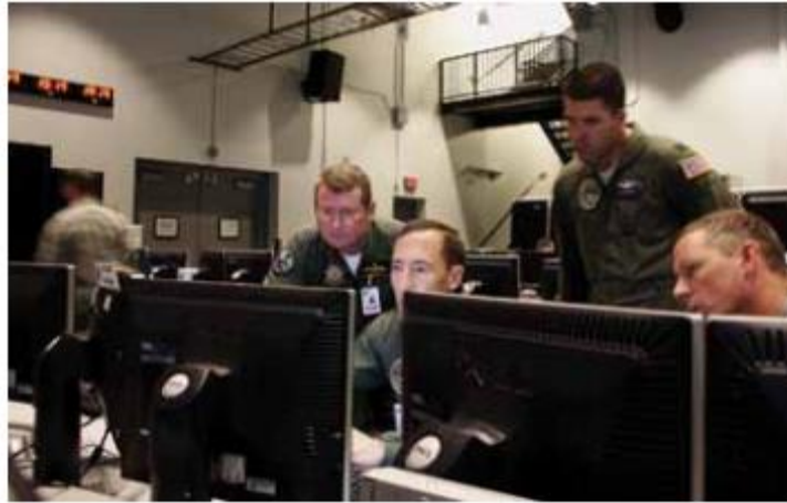
Figure 8: Play proceeds at Schriever V (Wright 2009: 27).

Figure 8 shows players in the Schriever V wargame (Wright 2009: 27). Although the screens are less impressive than those in the JICSpOC, the players are still interacting with the “real world” through a screen much like the representations of the everyday practices of space security. From the comparison of these images, we can surmise that the participants in the Schriever games are supposed to feel an increased sense of realism through the choice of venue.