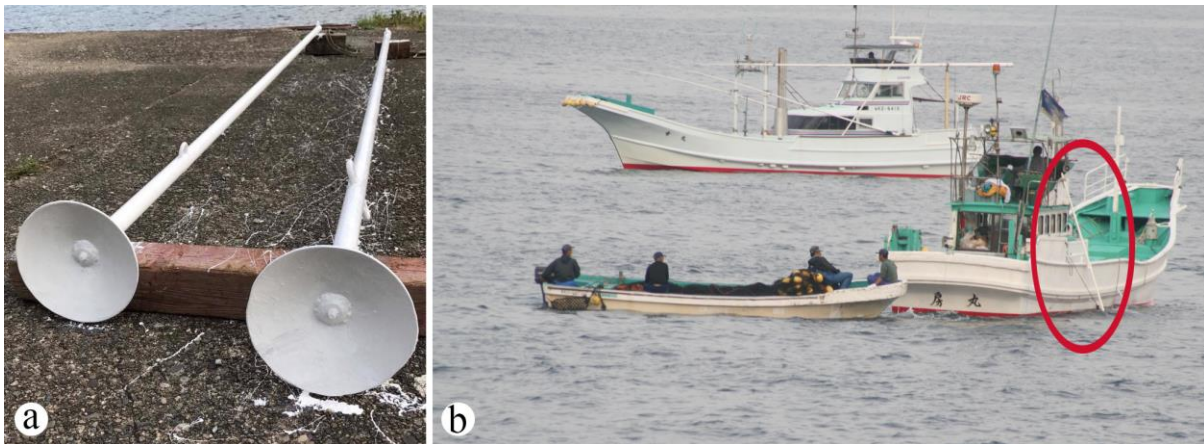
Figure 2. (a) Metal trumpets utilized in the dolphin drive hunts. (b) Trumpets (indicated by circle) are mounted on vessels and placed in the water. Using a hammer or other object, fishermen bang on the poles to create loud noise (up to 205dB) that disorients the dolphins.