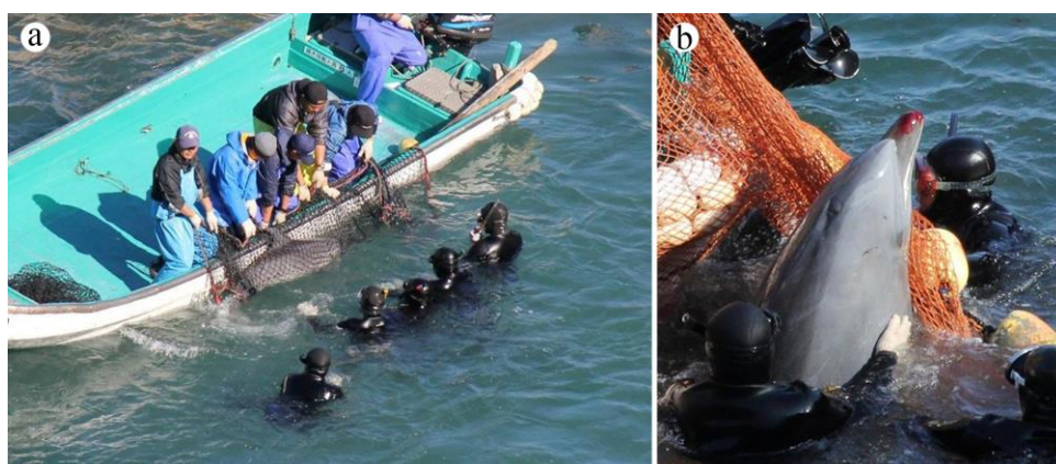
Figure 4. (a) A dolphin is secured in a net after selection for a marine park. Image: Sea Shepherd Conservation Society. (b) An obviously injured dolphin being restrained during selection for a marine park after a drive hunt. Image: Sea Shepherd Conservation Society