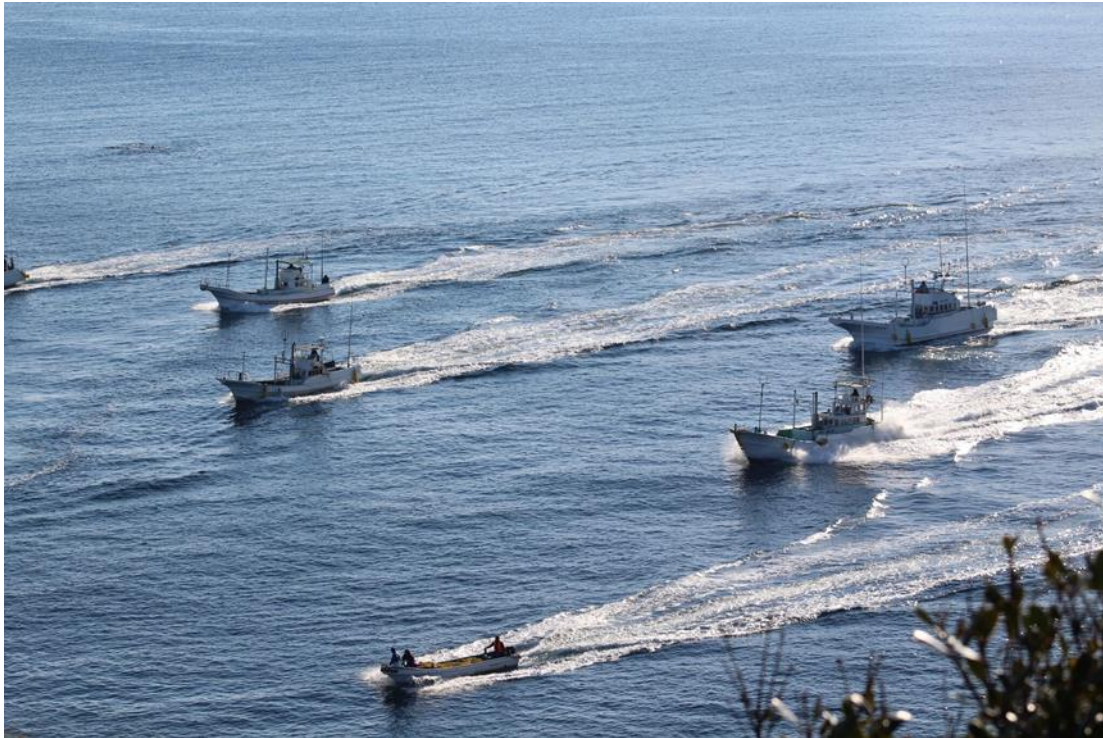
Figure 1. A fleet of boats returns from a dolphin drive hunt in Taiji, Japan.