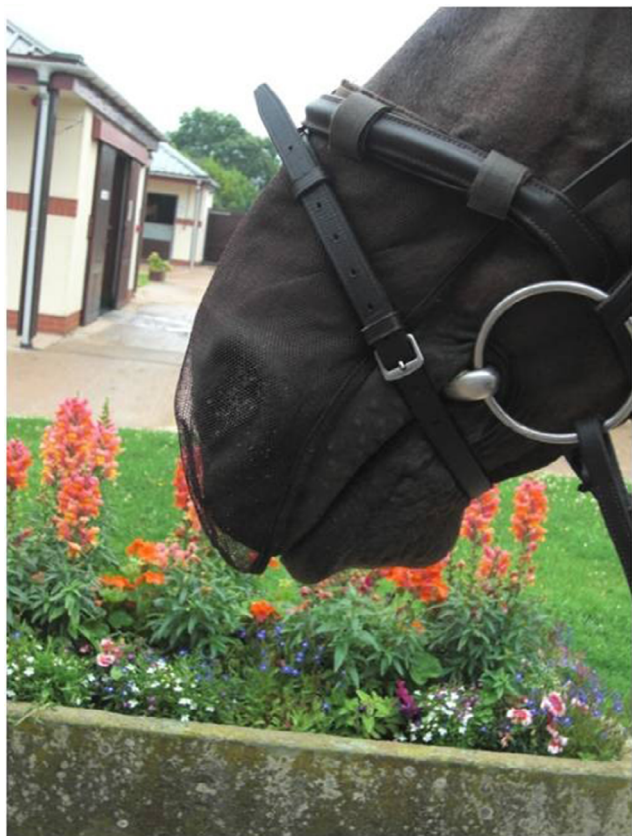
Figure 1 Horse wearing a nose net.

There are drugs available for the treatment of neuropathic pain in people and some of these have been used in trigeminal-mediated headshakers to see if their neuropathic pain could be managed this way. Even in people with neuropathic pain, these drugs have inconsistent results and may confer side effects including drowsiness. A challenge to the efficacy of neuropathic pain is the heterogeneity of the