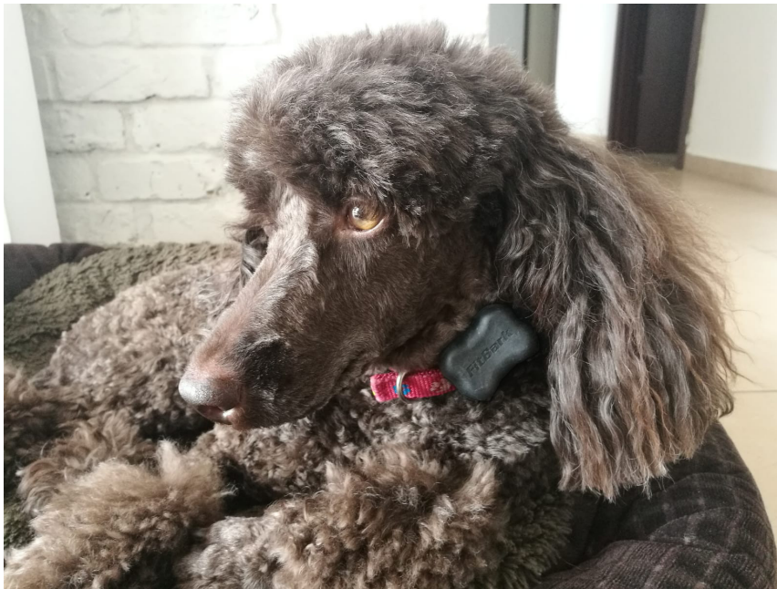
Figure 1. Becky trying on an activity tracker investigated in this study.

While there is a growing body of research on the challenges and opportunities of regular ‘human’ wearables, as well as users’ perceptions thereof [3], much less is known on those topics for pet wearables. In the current study we aim to deepen the understanding of the impact of quantified technologies on the human-animal bond and the lifestyles of owners and pets, by studying the perceptions of 81 users of a widely available and popular commercial canine activity tracker. We focus in particular on the following research questions: