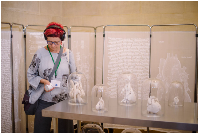
Figure 2 Visitors could listen to the soundscape on headphones for a more immersive experience.

free-text questions. It was administered before and after a viewer had experienced the piece, including the soundscape. Two researchers were always present, invigilating the artwork and collecting questionnaires from the viewers, as well as helping them to set up the headphones and answering any questions they may have on the genesis of the piece or on the 3D heart models.