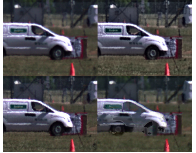
Fig. 4. Frame t = 19 of ‘Van driving in circles at 0.75km’ sequence. (top-left) distorted frame. (top-right) CLEAR2 (coarse registration). (bottom-left) DLA adapted from [17]. (bottom-right) EVS [7].

This paper has introduced a new method for mitigating atmospheric distortion in long range surveillance imaging. The improvement of visibility of moving objects in observed sequences is achieved using recursive image fusion in the DT-CWT domain. The moving objects are detected and tracked using modified GMM and Kalman filtering. Both background and moving objects are restored by adding the current frame