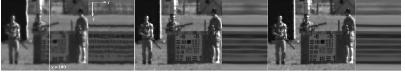
Fig. 2. Results of ‘People with tools’ sequence (Left), using a registration method with a sliding window of N_b = 50 (Middle) and a recursive technique (Right). In each group, the left image shows the frame at t = 150 and the right image shows the yt planes at column x = 190 of this frame in the first 200 frames.