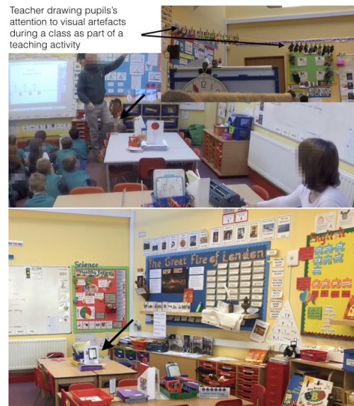
Figure 2: (Top) visual referencing during a lesson. (Bottom) examples of visual displays and decorations. Downwards arrows point to where the child with a VI sits.

Boredom – This lack of stimulation can lead to disengagement and boredom during individual and group work and some TAs took it on themselves to provide alternatives, for example through pre- and post-tutoring: “it’s nice to talk to [him] about what we’re going to be doing before it happens so he got a bit of background because all other children have the stimulation of displays on the wall and the interactive