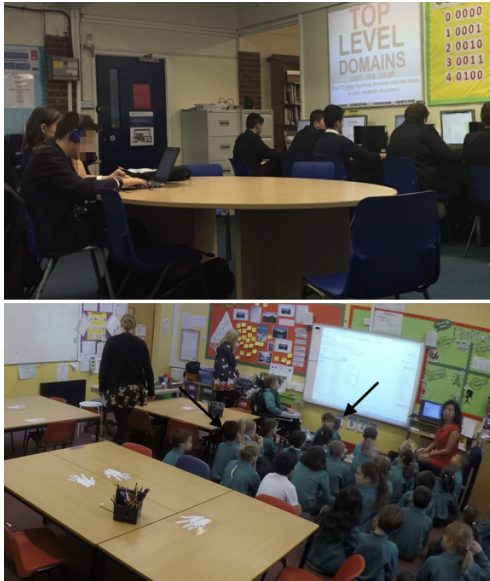
Figure 3: (Top) TA Bubble. (Bottom) Carpet Time

to this and that', then the pupil stops listening to the teacher even when the teacher is talking, they don't think the teacher is talking to them, they're actually conditioned not to listen" (QTVI9); 2) Spatial disconnects: "a TA needs to talk to the pupil about what's going on, so teachers often then put them at the back of the class so they're not disturbing others" (QTVI5); and 3) Material disconnects: "it is the TAs who have to adapt [the material] it would be wonderful if somehow that material was suitable for anybody" (SENCO3).