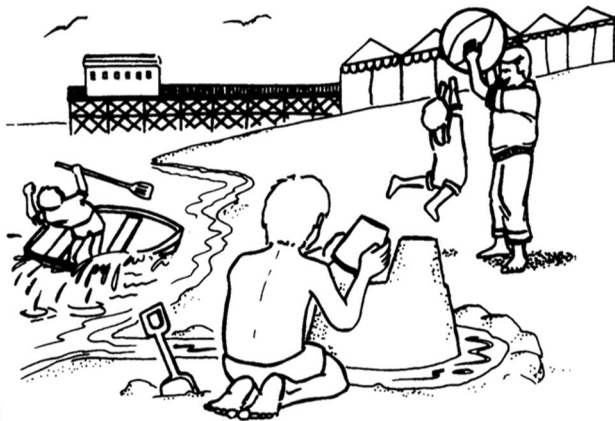
Fig. 2 Example of a picture that can be used to elicit conversational speech. A scene of this kind can be used to assess naming and also to probe aspects of language comprehension, at the level of single words (using questions such as, ‘Where is the sandcastle?’) and grammatical relations embodied in sentences (using instructions such as, ‘Point to the thing that the boy is holding above the boat’)

forward and major neuroanatomical associations are in bold italics: a, amygdala; ATL, anterior temporal lobe; BG, basal ganglia; h, hippocampus; IFG, inferior frontal gyrus/frontal operculum; ins, insula; OFC, orbitofrontal cortex; PMC, posterior medial cortex (posterior cingulate, precuneus); STG, superior temporal gyrus; TPJ, temporo-parietal junction. The ‘target diagrams’ below show typical profiles of neuropsychological test performance for each syndrome; concentric circles indicate the percentile scores relative to a healthy age-matched population and the distance along the radial dimension represents the level of functioning in the following cognitive domains: ex, executive skills; l, literacy skills; n, naming; nm, nonverbal memory; pr, phrase repetition; s, sentence processing; v, visuo-spatial; vm, verbal memory; wr, word repetition