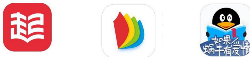
Figure 4: Examples of Chinese reading Apps

It should be pointed out that mobile traffic fees are quite high in China, so people prefer to download to their local devices through Wi-Fi at home or use low-traffic-cost ways to read. For that reason, most Internet literature websites have mobile adaptable versions, which will save mobile traffic fees for the users; many of them have developed their own apps. Users may download some works through the apps meaning it will not cause mobile traffic fees when reading on the move. The apps are just as functional as the websites. Depicted in Figure 4 are the icons of the apps of Qidian, iReader and QQ reading, all of which are well accepted among readers.