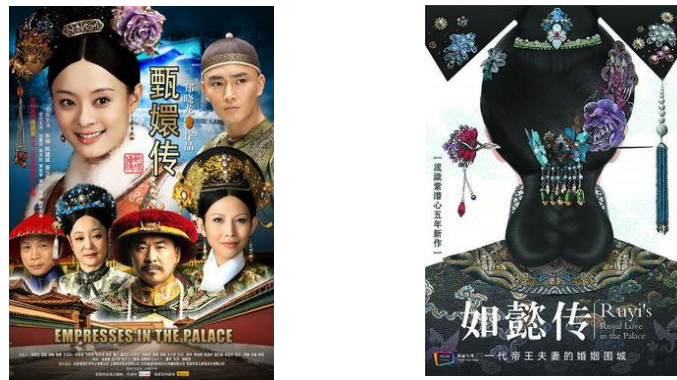
Figure 2: The Tale of Zhenhuan