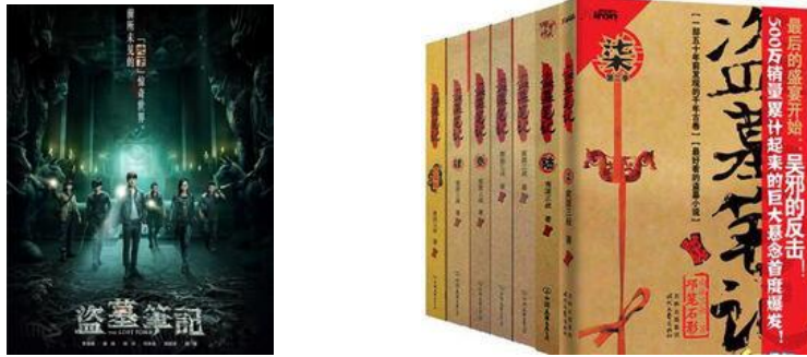
Figure 3: The Lost Tomb

This is the first seasonal online TV series in China and the adaptation by Xu Lei is scheduled to be dramatized in eight seasons, one season for each year. The first season was released in June of 2015. The novel series of the same name is about several people's adventure in ancient tombs, and it has enjoyed a wide readership since it was released online in 2006. Accordingly, the adapted TV series had been highly anticipated by its fans but turned out to be disappointing. Although there were 24,000,000 hits on the web within the first two minutes of its debut, the season was later criticized by the audiences for its weak storyline and poor quality. Some lines of the series even became jokes on social media.