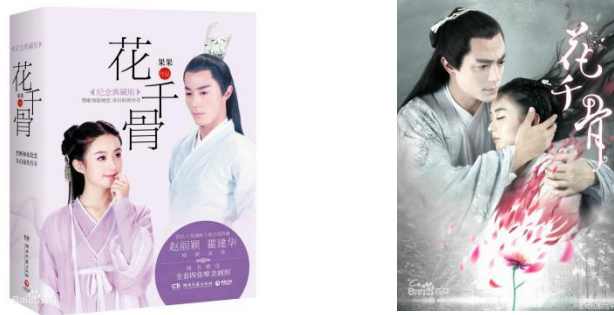
Figure 1: Hua Qiangu

adapted to the TV drama Hua Qiangu , with popular Chinese TV star Zhao Liying (赵丽颖) and Huo Jianhua (霍建华) starring in it (depicted in Figure 1 below). The TV drama was a big hit in the summer of 2015, with the number of online plays at 12 billion only nine weeks after it was released. 21 According to news reports, the TV maker of Hua Qiangu , Ciwen Media, earned about 0.229 billion RMB yuan from this. Ciwen Media received 2.6 million RMB yuan from making a derivative TV drama, the Extra Story of Hua Qiangu , with iQiyi. Moreover, both Zhao Liying and Huo Jianhua became super TV stars. The games based on Hua Qiangu were also quite successful. All in all, the Super IP Hua Qiangu is a great success for the many different parties participating in it. Even the New York Times reported its success on October 29, 2016. 22