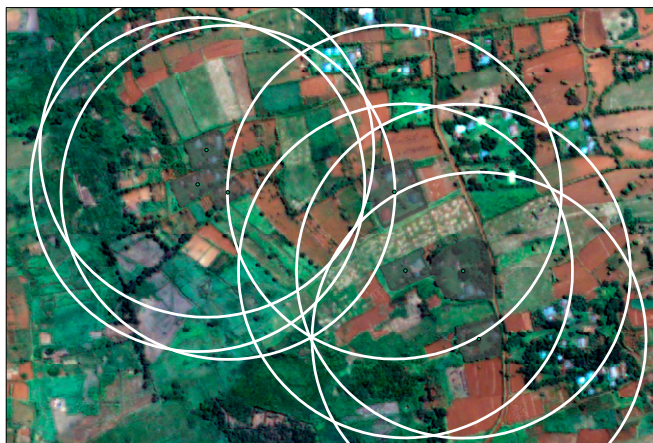
Fig. 3. The single-level approach to linking satellite and household data often uses a single radial buffer zone. This can be problematic as it results in overlapping regions and multiple pixels being assigned to multiple households when households would not have access to some land parcels such as multiple homesteads.

Tree regression allows for complexities to be identified in the relationships between wealth and RS variables. Households characterized by large building sizes had a lower proportion of bare agricultural land and a lower proportion of planted agricultural land at the start of the second planting season. Wealthier households derived 71% of their incomes from nonagricultural sources (23). Therefore, the results may indicate that these households do not need to plant second crops during the short rainy season. Poorer households were characterized as having more bare land within the agricultural fields (level 2) in September, which means