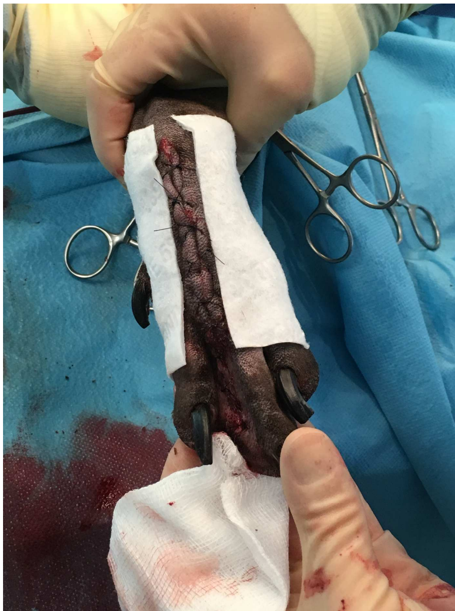
Figure 2 a-e. The appearance of the incision immediately postoperatively (3a), five days postoperatively (3b), eight weeks (3c), sixteen weeks (3d) and nineteen weeks (3e) postoperatively