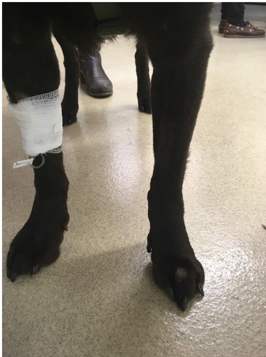
Figure 2 a-e. The appearance of the incision immediately postoperatively (3a), five days postoperatively (3b), eight weeks (3c), sixteen weeks (3d) and nineteen weeks (3e) postoperatively