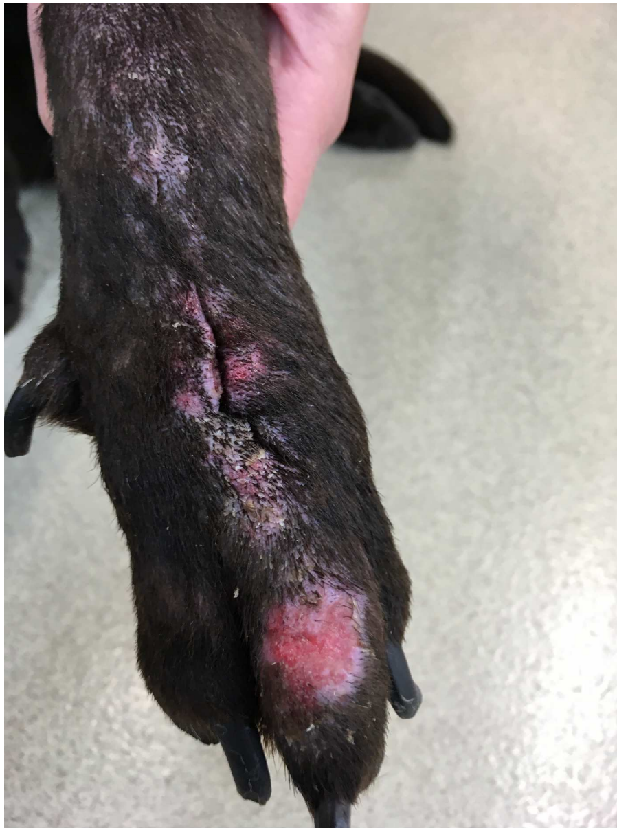
Figure 2 a-e. The appearance of the incision immediately postoperatively (3a), five days postoperatively (3b), eight weeks (3c), sixteen weeks (3d) and nineteen weeks (3e) postoperatively