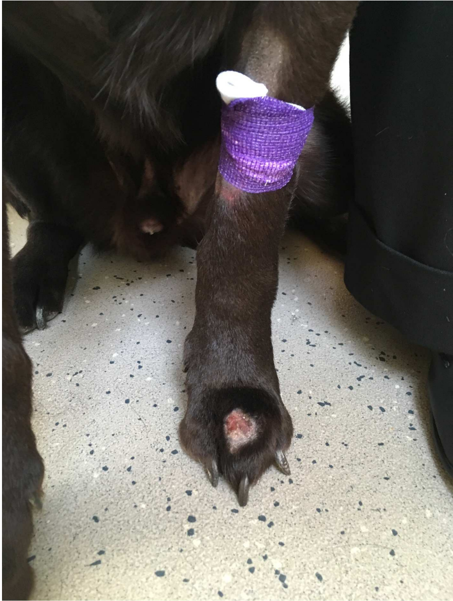
Figure 2 a-e. The appearance of the incision immediately postoperatively (3a), five days postoperatively (3b), eight weeks (3c), sixteen weeks (3d) and nineteen weeks (3e) postoperatively

1 2 3 4 5 6 7 8 9 10 11 12 13 14 15 16 17 18 19 20 21 22 23 24 25 26 27 28 29 30 31 32 33 34 35 36 37 38 39 40 41 42 43 44 45 46 47 48 49 50 51 52 53 54 55 56 57 58 59 60