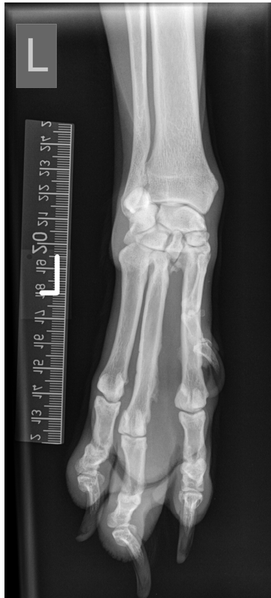
Figure 4. A dorsopalmar radiograph of the left manus taken 3.5 months postoperatively.

1 2 3 4 5 6 7 8 9 10 11 12 13 14 15 16 17 18 19 20 21 22 23 24 25 26 27 28 29 30 31 32 33 34 35 36 37 38 39 40 41 42 43 44 45 46 47 48 49 50 51 52 53 54 55 56 57 58 59 60