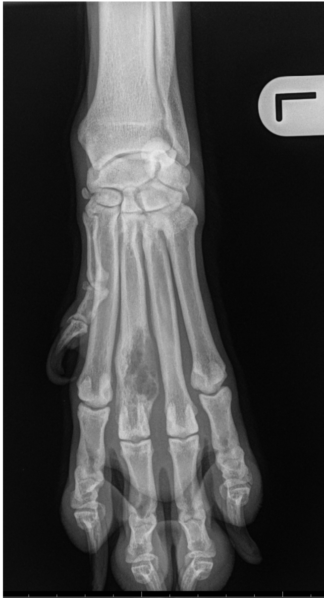
Figure 1. A dorsopalmar radiograph of the left carpus and manus showing severe osteolysis of the distal third of metacarpal III.

1 2 3 4 5 6 7 8 9 10 11 12 13 14 15 16 17 18 19 20 21 22 23 24 25 26 27 28 29 30 31 32 33 34 35 36 37 38 39 40 41 42 43 44 45 46 47 48 49 50 51 52 53 54 55 56 57 58 59 60