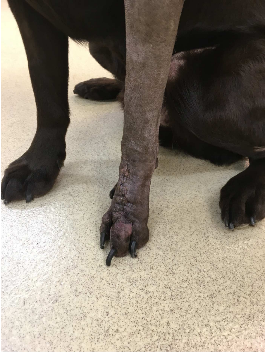
Figure 2 a-e. The appearance of the incision immediately postoperatively (3a), five days postoperatively (3b), eight weeks (3c), sixteen weeks (3d) and nineteen weeks (3e) postoperatively

1 2 3 4 5 6 7 8 9 10 11 12 13 14 15 16 17 18 19 20 21 22 23 24 25 26 27 28 29 30 31 32 33 34 35 36 37 38 39 40 41 42 43 44 45 46 47 48 49 50 51 52 53 54 55 56 57 58 59 60