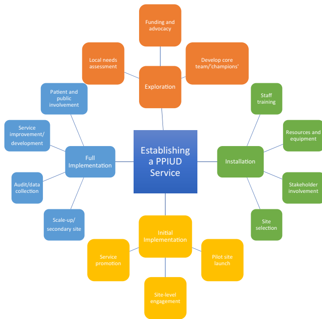
FIGURE 2 Key components of establishing a PPIUD service using Stages of Implementation framework. [Colour figure can be viewed at wileyonlinelibrary.com ]

this were available. 7 Demonstration of local unmet need along with service-user support provided a useful tool in gaining the funding and support necessary to introduce a PPIUD service. We established a PPIUD steering group to guide overall project direction and facilitate communication between key stakeholders. This included a senior obstetrician, lead midwife, sexual health lead, general practitioner, clinical and qualitative research teams, and a patient group representative. Involving key individuals at an early stage in the process can assist in identification and resolution of potential barriers.