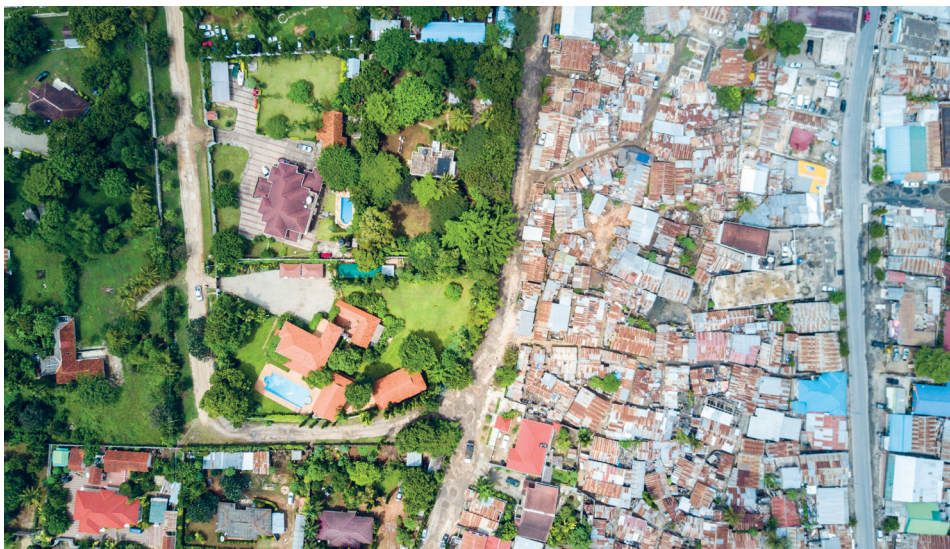
Photo: Unequal housing in Tanzania

Developing sustainable, national strategies for monitoring health inequalities ideally requires data capture at the local level [3], which can then be aggregated to provide regional and national data. It also requires innovative uses of existing data sources, including public sector administrative data, business data and new forms of data emerging from society's use of Information and Communications Technology (ICT).