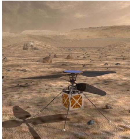
4 Artist's impression of the Mars Helicopter Scout. At the time of writing, trials were still being conducted and NASA had not decided whether the MHS will fly with the Mars 2020 mission. If it does, it will explore the terrain ahead of the rover, enabling it to drive up to three times further each martian day. The helicopter would fly no more than three minutes per day and cover a distance of about 600 m.

So far, we have only considered traditional aircraft that use rotors or fixed-wings. These make most effective use of an atmosphere for lift, but are not the only options. Science fiction has inspired suggestions that the thick atmosphere and low gravity of Titan would allow humans to use wingsuits and flap like birds, providing enough power to stay aloft. This concept could be extended to