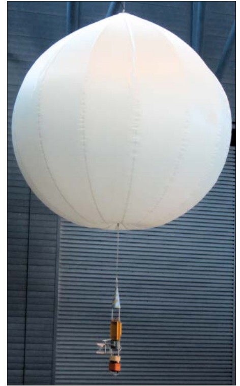
2 The Russian Vega balloon mission to Venus, on display at the Udvar-Hazy museum.

These factors provide a foundation for designing aircraft for use on other planetary bodies, but there are many others that must be considered. For example, given that there are currently no extraterrestrial runways, aircraft for all extraterrestrial bodies would need the ability to take off and land vertically, or to stay aloft permanently. Fixed-wing aircraft are not good at vertical take-off and landing, which means that proposals tend to be rotorcraft or hybrid vehicles with some fixed-wing and some vertical rotor elements. Using rotors