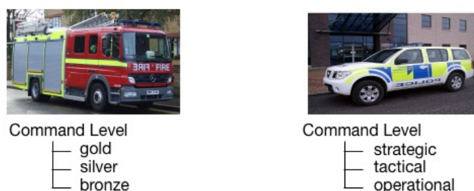
Figure 1. Example of diverse knowledge representation

For example, Figure 1 depicts how the fire brigade and the police represent different Command Levels .