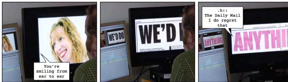
Figure 2 – The problem transition from reality TV programme to newspaper headlines

In extract 3 which is shortly after extract 2b, the director prefaces his identification of a further problem by saying that he is in ‘two minds’. In other words, that he is undecided. In his long pause before formulating the problem as a transition problem (e.g. ‘to go from that the newspaper’), there is also an invitation for the editor to formulate the problem for him. It is a routine feature of showing not just an aligned stance but shared awareness of a problem that either party in the editing suite completes the other’s utterance (Lerner 1996) be it a formulation, an assessment or a proposal. By inference, from the director’s identification of the problem as one of transition, either ‘that’ (the medical TV show clip) or the newspaper coverage (see figure 2) will need to be altered and potentially removed.