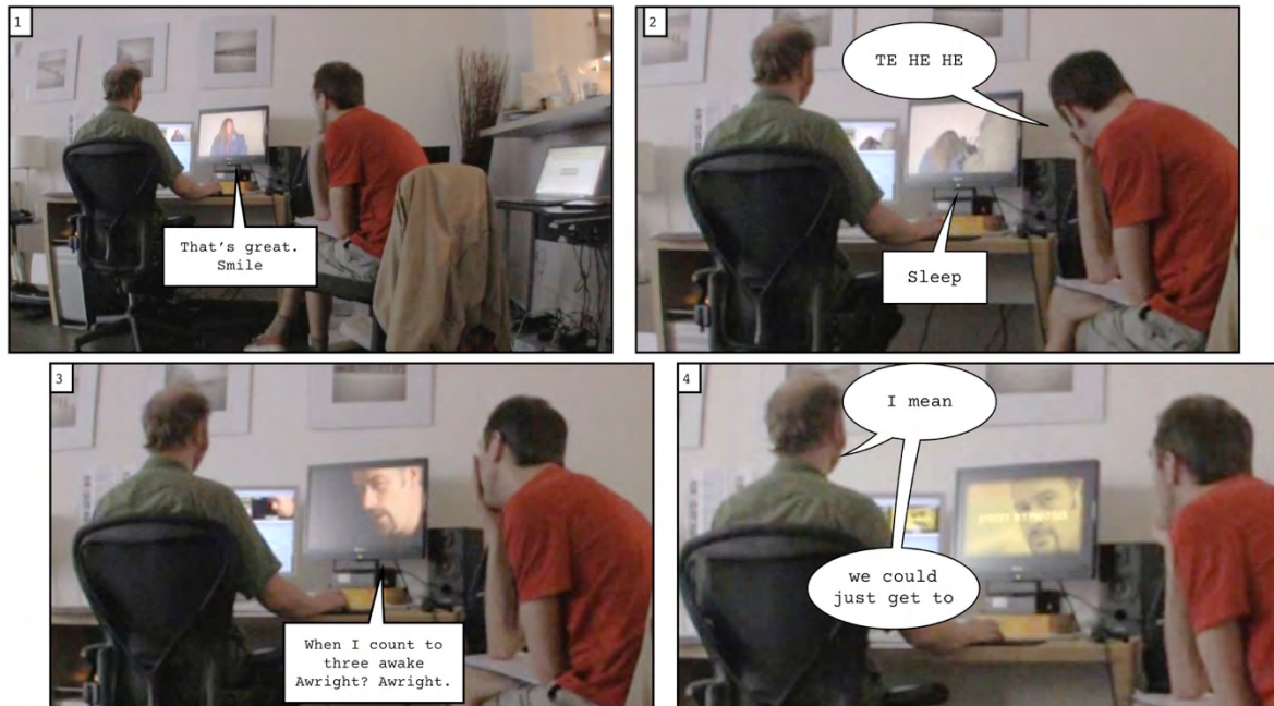
Extract 2a Divergent stances on the hypnotism scene (square speech bubbles for film audio)

268 ((hypnotist hits J on head to wake her up)) 269 270 D: TE HE HE ((continues laughing into his hand))----- 271 [------] 272 273 E: [I mean (4.0) we could just get to 274 275 D: >No no< no I think it's really important to see a shot of her 276 before we cut back t-to- go back to the street hypnosis 277 278 E: >Yeah no no< absolutely but 279 280 D: I think that- that works