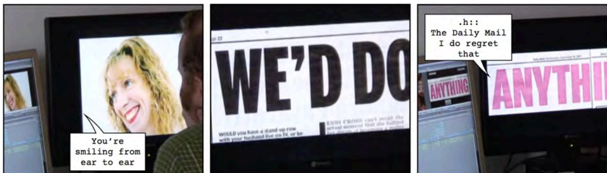
Figure 2. Smiling face to newspaper headline