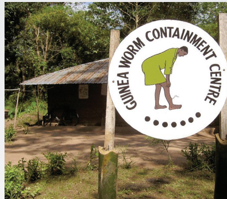
This 2004 photograph depicted the entrance to a Nigerian Guinea worm containment center. The sign at the entrance displayed a drawing of a Guinea worm sufferer.

Guinea worm disease was once a substantial cause of illness in tropical and subtropical Africa and Asia, but cases declined as water sanitation improved in the 19th century. In 1986, the World Health Organization resolved to eradicate the parasite, and in 2015, due in large part to the work of the Carter Center, led by former Centers for Disease Control and Prevention Deputy Director Donald R. Hopkins, there were only 22 cases in 4 countries (Chad, Ethiopia, Mali, and South Sudan).