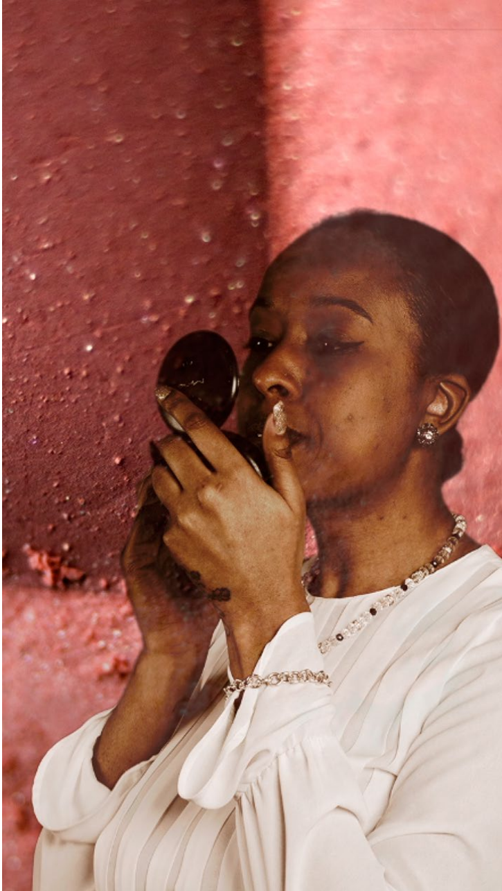
Fig. 26.3 Roshini Kempadoo, Screen still from the artwork Face Up , 2015. Nana 05.