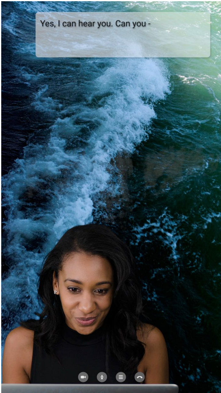
Fig. 26.7 Roshini Kempadoo, Screen still from the artwork Face Up , 2015. Deirdre 04.