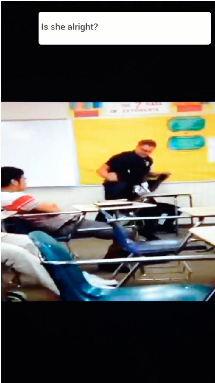
Fig. 26.6 Roshini Kempadoo, Screen still from the artwork Face Up , 2015. Nana 07. © Roshini Kempadoo.