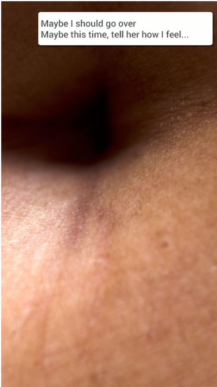
Fig. 26.4 Roshini Kempadoo, Screen still from the artwork Face Up , 2015. Nana 11. © Roshini Kempadoo.