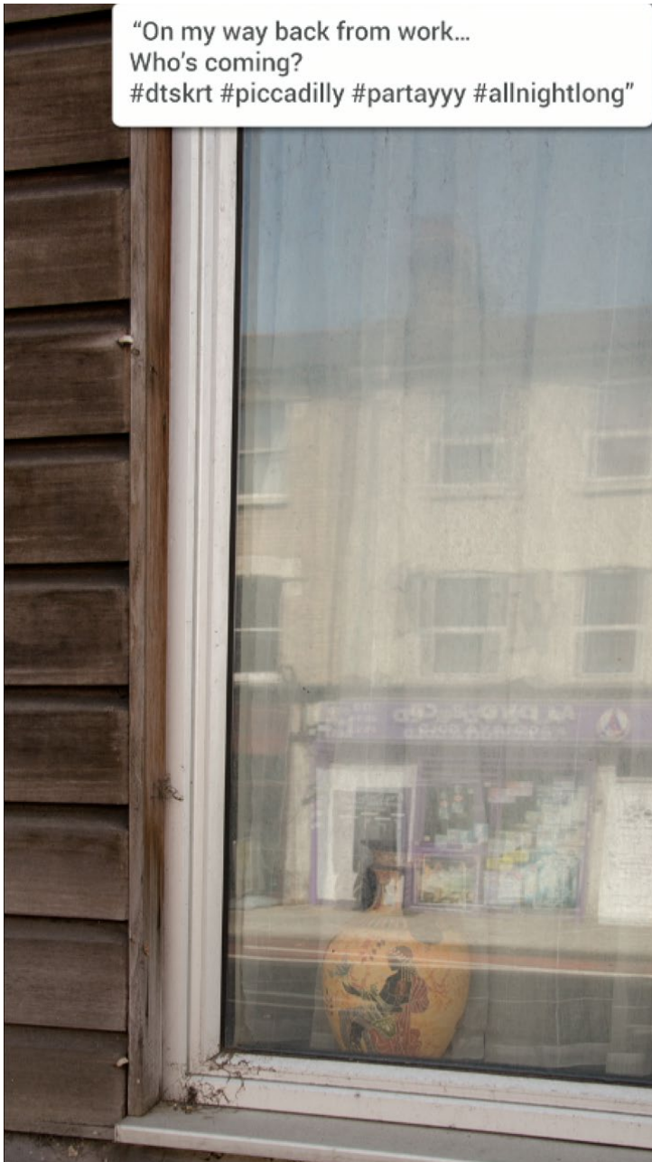
Fig. 26.2 Roshini Kempadoo, Screen still from the artwork Face Up , 2015. Nana 01. © Roshini Kempadoo.