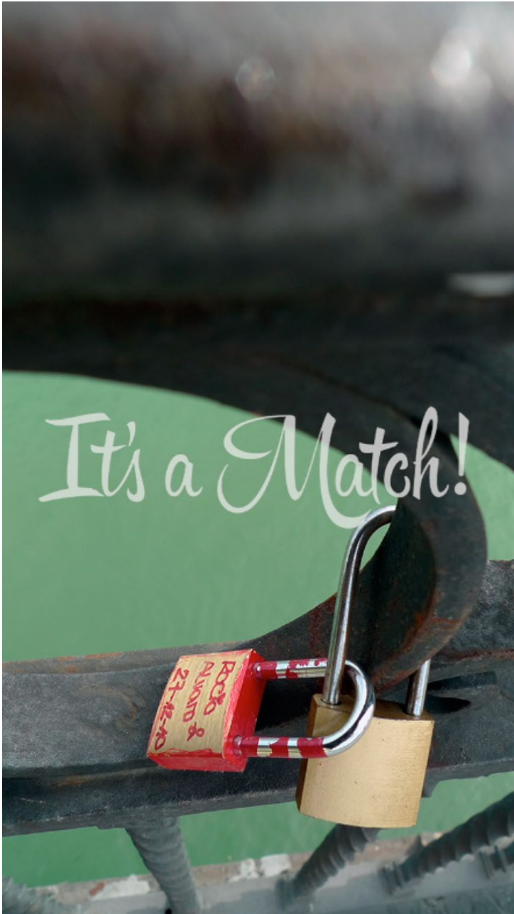
Fig. 26.5 Roshini Kempadoo, Screen still from the artwork Face Up , 2015. Nana 09. © Roshini Kempadoo.