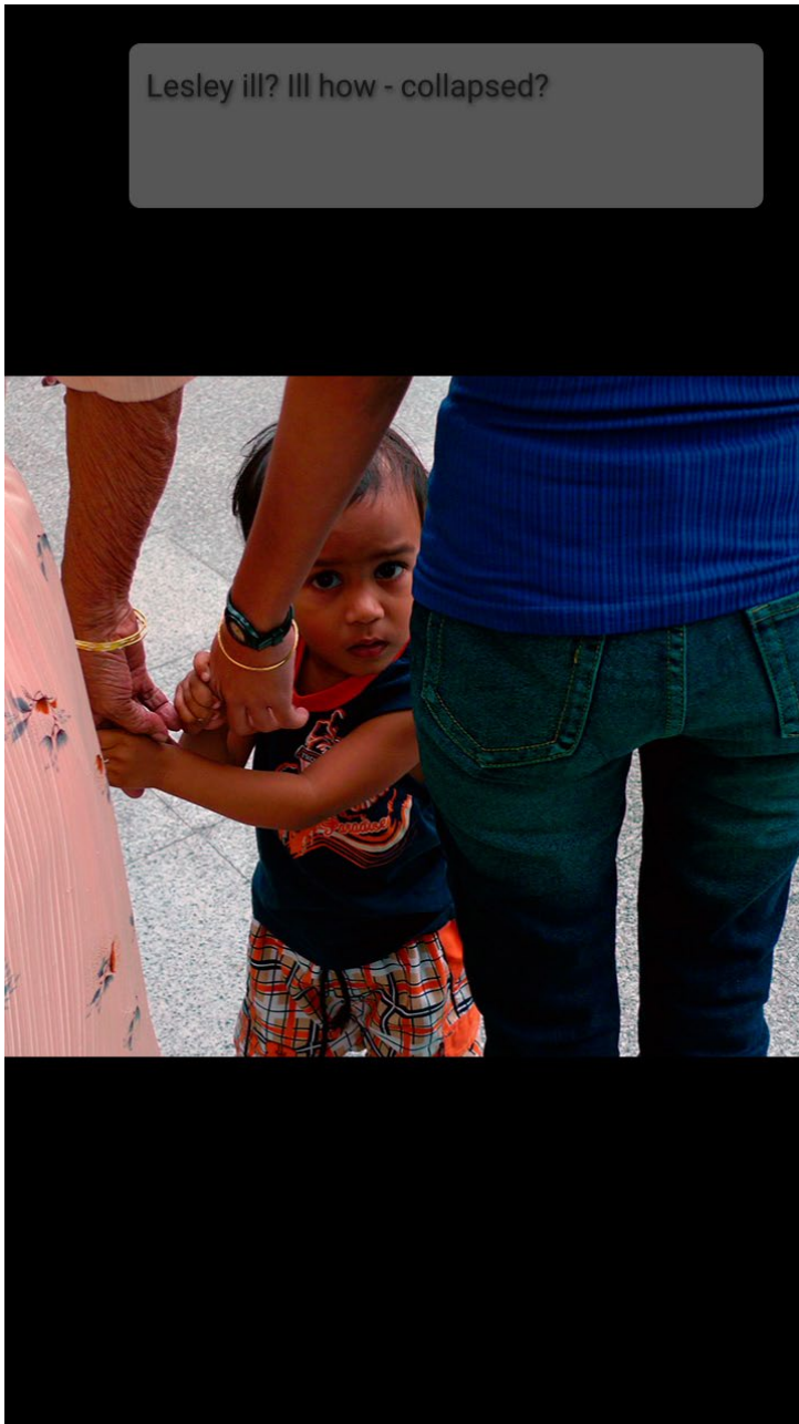
Fig. 26.8 Roshini Kempadoo, Screen still from the artwork 'Face Up', 2015. Deirdre 05 © Roshini Kempadoo.