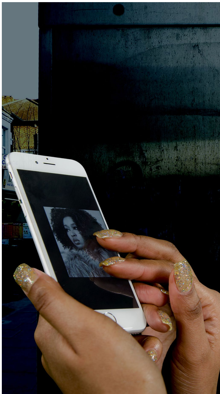
Fig. 26.1 Roshini Kempadoo, Screen still from the artwork Face Up , 2015. Nana.