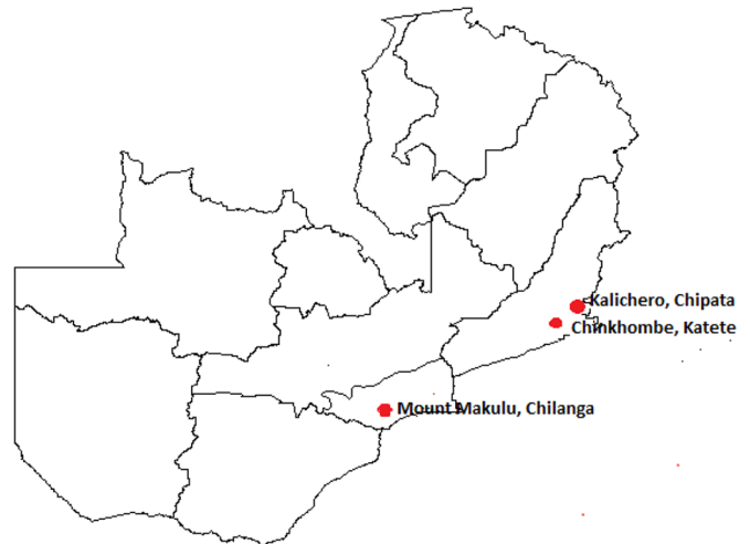
Fig. 2. Map of Zambia showing the location of the three sites.

Four field planting methods: double row, single row, tied ridge and flatbed (no ridges) were evaluated in on-farm experiments in two agricultural camps: Chinkhombe, Katete district (S14°1’60, E 31°55’60; 1069 metres above sea level (masl)) and Kalichero, Chipata (S13°26’60, E 32°21’1; 1040 m asl) in Eastern Zambia and in the researcher managed trials at Mount Makulu Central Research Station, Chilanga (S 15°32’52’; E 28°14’54’; 1206 m asl) (Figures 1 and 2). The two agricultural camps were purposively selected because of their high groundnut production, slight over 15% of the total area under cultivation in the respective districts, and were also serviced by the Farmer out Grower Foundation Limited (FoF Ltd), a private sector agricultural trading company, one of the project partners. According to the Department of Agriculture