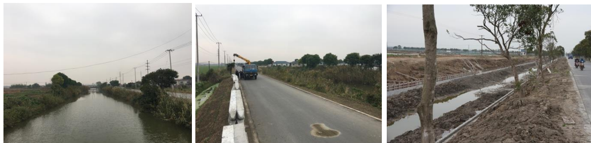
Figure 2. The transformation of Xinjiang Road River under the river project from 14-11-2017 to 29-03-2018.