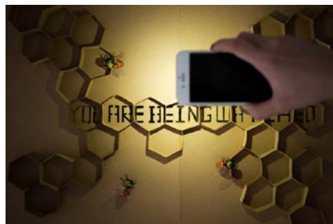
Figure 6b. 'Discipline Society – You are Being Watched'