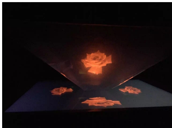
Figure 4: 'Affective Assemblage Hologram'