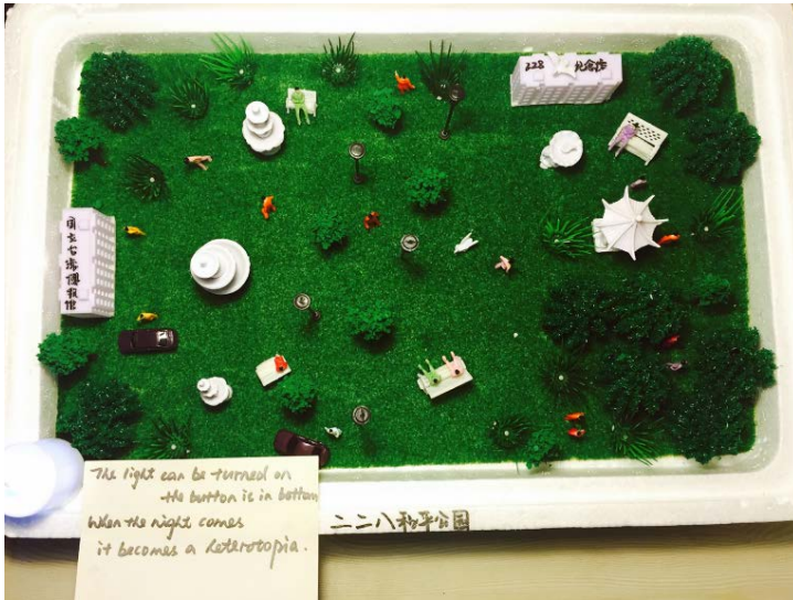
Figure 1: 'Heterotopia'