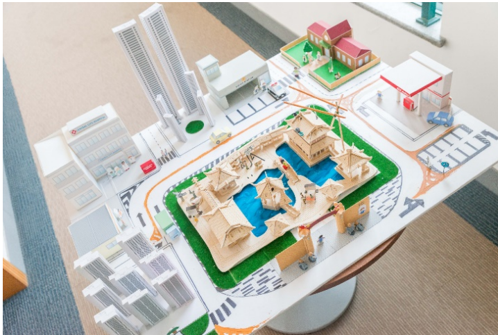
Figure 2: 'Heterotopia in a Discipline Society'