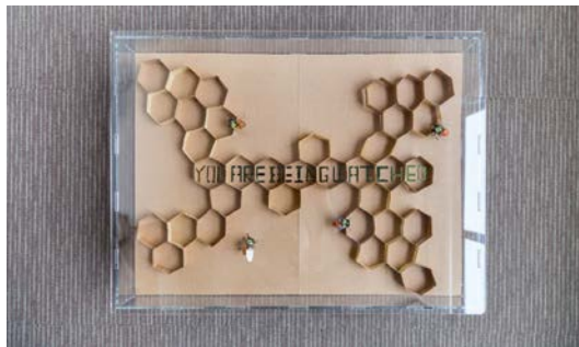
Figure 6a. 'Discipline Society – You are Being Watched'