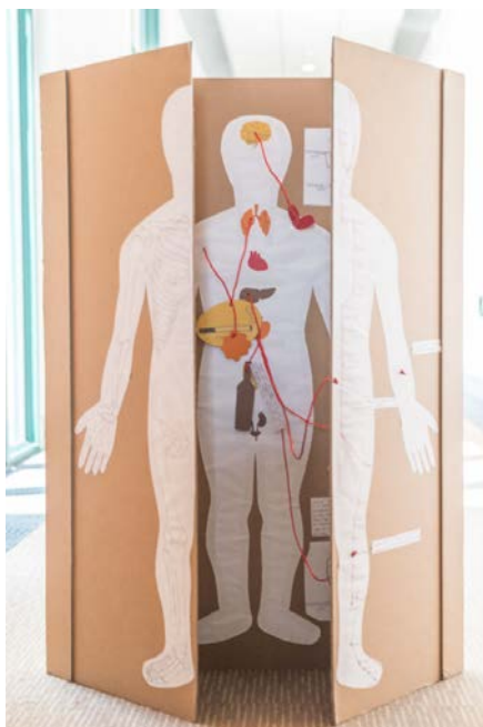
Figure 3: 'Embodied Assemblage'