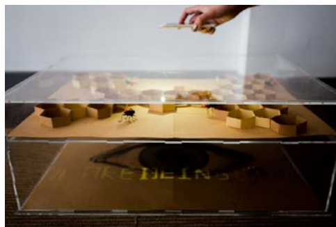
Figure 6c. 'Discipline Society – You are Being Watched'