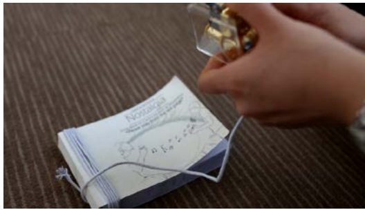
Figure 6. 'Communication as Movement' (flipbook with music box)