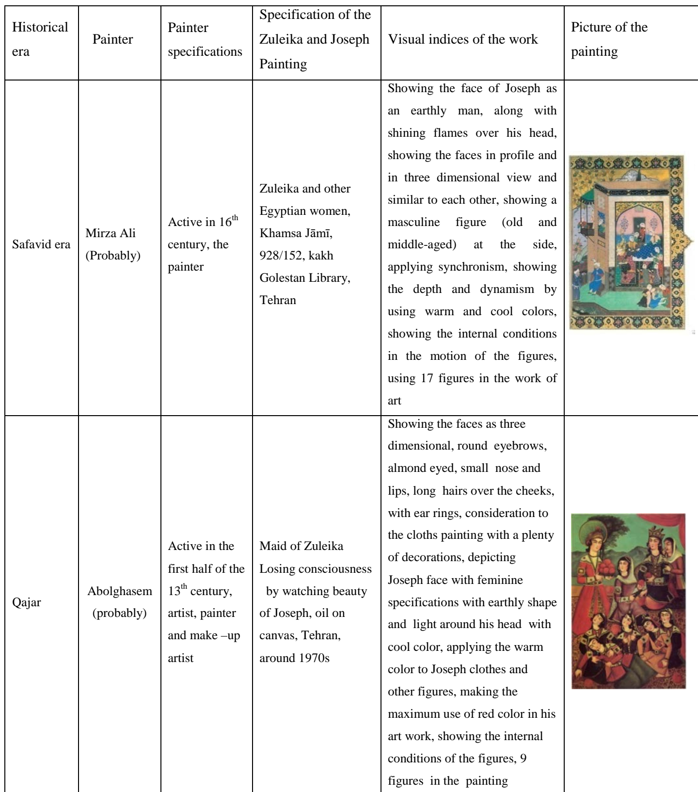
Table 3: visual and aesthetic indices of the Zuleika and Joseph party painting from the Safavid era till the present era