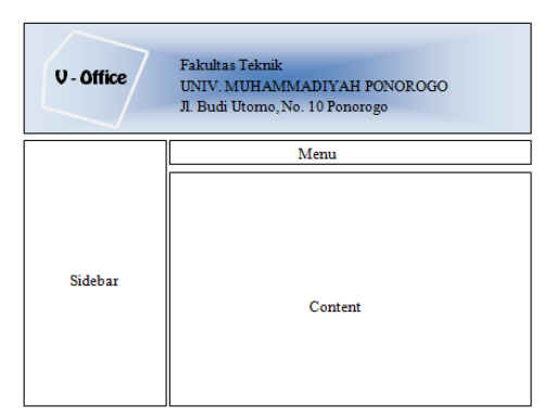
Figure 4. User Interface Desain

User interface is designed as the way for designing layout from the application so that the design which is made can be used ( user friendly ). Figure 4 below shows the user interface design.